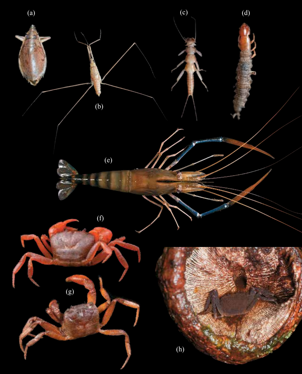
Fig. 2. Example of taxa from the Pelagus area. (a) Whirligig beetle, Porrhorrhynchus marginatus ; (b) Water strider, Ptilomera sp.; (c) Stonefly family, Perlidae; (d) Larva of fishfly, Protothermes sp.; (e) giant freshwater prawn, Macrobrachium rosenbergii ; (f) male Ibanum aff. bicristatum ; (g) Bakousa cf. kenepai ; (h) Arachnothelphusa sp. inside a tree-hole. Images are not to scale. Taxonomic investigations of the three crab species are currently ongoing.