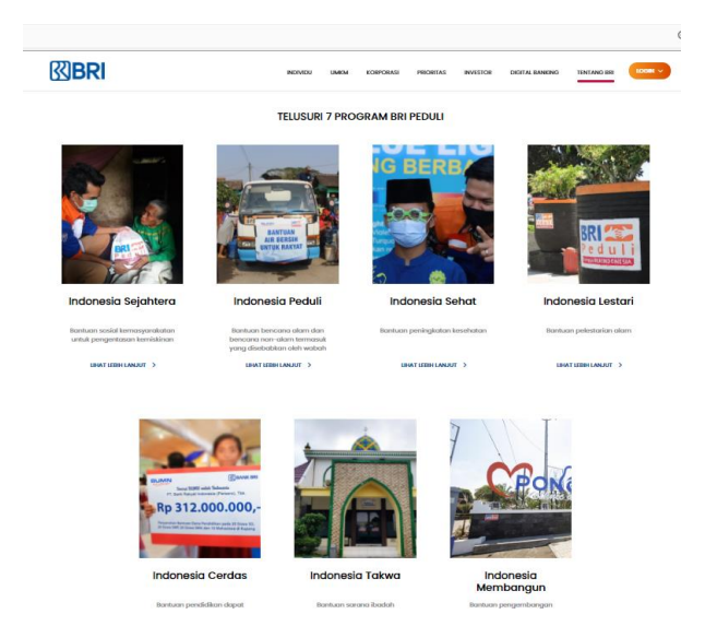
Figure 1. Display of the Bri.Co.Id Website in the CSR Column

The naming of the BRI Peduli CSR program describes the focal point of BRI's CSR implementation for the benefit of the Indonesian people and in accordance with the company's vision and mission. The program carried out by each category due to observations by researchers shows progress and balanced CSR implementation in carrying out CSR principles and covering various aspects of community needs. Based on this, BRI, through its CSR program, contributes not only to building a good reputation but also having an impact in accordance with the benefits felt by the community so that it will support the loyalty of the community and BRI customers. This is as stated in Lee et. al's research (2017), that empirically CSR activities have a positive and significant effect on company reputation and customer loyalty and brand image (Park et.al., 2014).