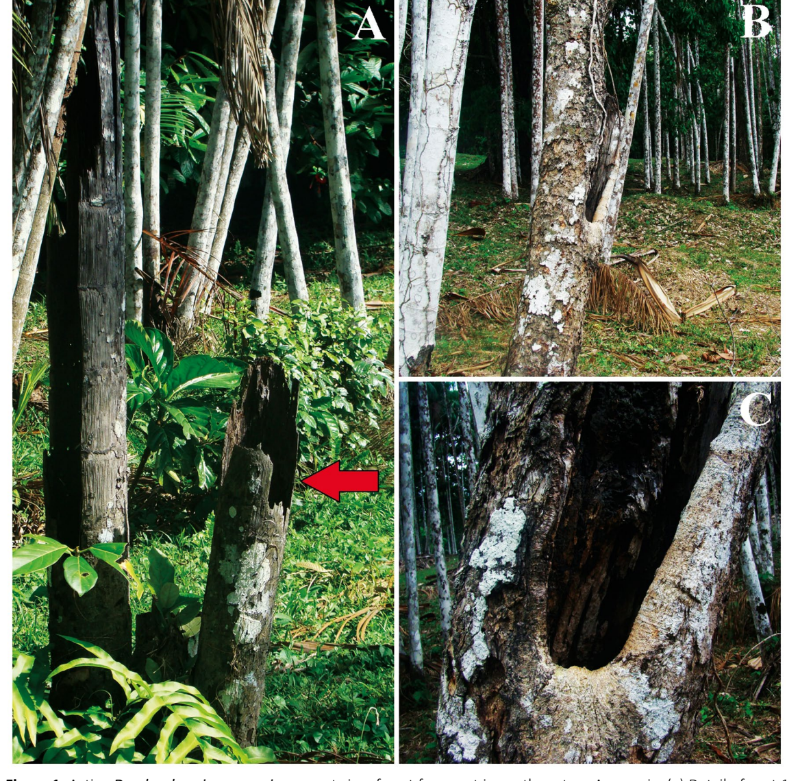
Figure 1. Active Dendroplex picus peruvianus nests in a forest fragment in southwestern Amazonia. (a) Detail of nest 1 (red arrow). (b) Nest 2 in trunk. (c) Detail of entrance of nest 2.

We found nests in open areas near the forest edge (December 2012, October 2013). Nest 1 was built in a broken trunk of a dead Bactris gasipaes palm (Fig. 1a). Nest 2 was built in the cavity of the trunk of a Samanea saman (Fabaceae) (Fig. 1b, c).