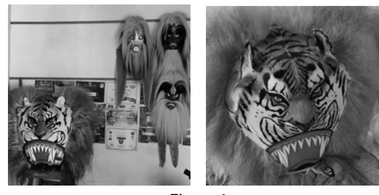
Figure 4 Reog Handicraft Products that are Ready to be Marketed

displaying their products in the Convention Hall building. Craftsmen can get more benefits, especially in terms of income, if certain events are held in the center, such as the Ponorogo Regency National Cooperative Day commemoration which is held on July 28 - August 4 2019. Based on interviews, they can sell 3-4 units of Bujangganong masks during the event. it takes place. Meanwhile, on weekdays, the center building is very quiet from visitors, so the products on display are not selling well.