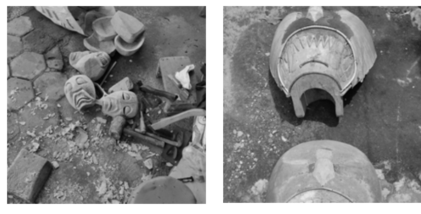
Figure 2 Production Process for Making Reyog

Some craftsmen also carry out the production process at the center. However, because the center only provides equipment, this makes the craftsmen spend more money because they have to transport raw materials and labor there. From there the existence of industrial centers does not provide any benefits in terms of production aspects because all craftsmen actually already have production equipment in their respective homes and they prefer to carry out the production process at home for reasons of operational cost efficiency.