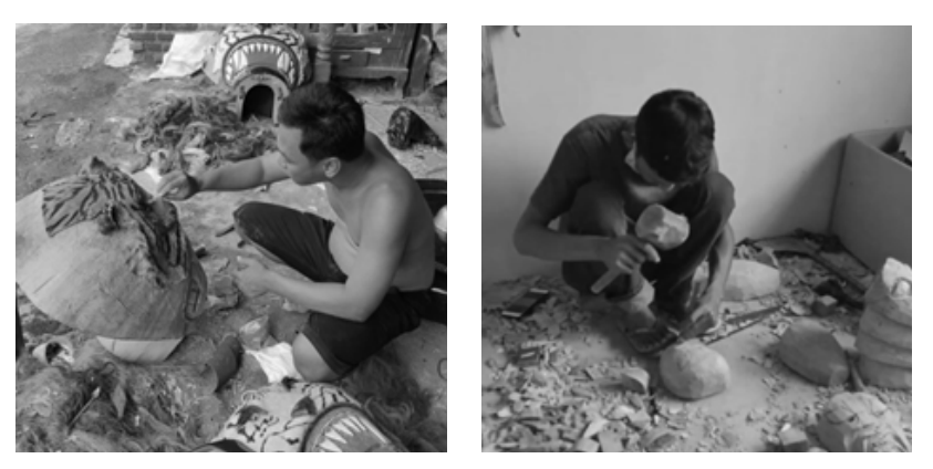
Figure 3 Manpower Owned by Craftsmen

Regional Banking Efficiency ..... MediaTrend 17 (2) 2021 p. 275-289