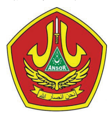
Figure 1 Official Symbol of Banser

migration of the prophet. By using Banser as the core cadre of GP Ansor, it has an idealization of what it is commonly perceived in Indonesia as Masyarakat Madani (the word madani comes from Medina, civil society based on the revitalization of Islamic values and local tradition by the prophet in the city of Medina). As symbolized in the logo of Banser, the pentagonal shape indicates the five pillars of Islam and Pancasila as the five pillars of Indonesian state. The bird's wings refer to Abābīl (the bird of Mecca), a miraculous bird (identified as swallows) mentioned in the Quran that protected the Ka'ba in Mecca from the Aksumite elephant army of Abraha in the year of 570. The Arabic words of nahnu anshārullāh mean "we are the saviors" or "we are the rescuers", indicating a commitment to 'protect', or to 'ensure security'. A symbol of the "fighting knife" represents "readiness for fighting" and explicitly promotes physical power and violence as the main tools of Banser for its security provision.