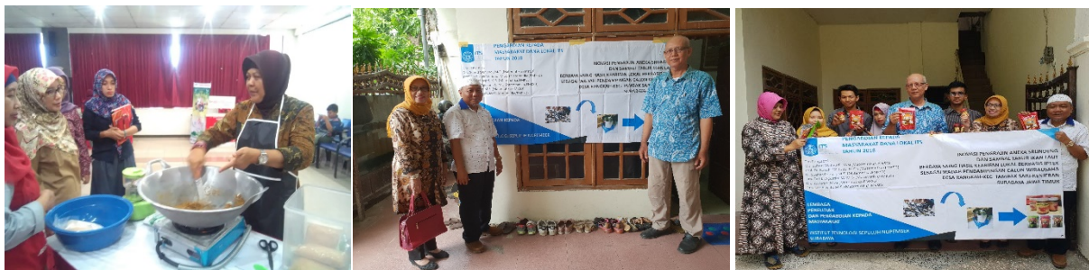
Figure 2. Documentation of activities with Serundeng SME partners and technology transfer