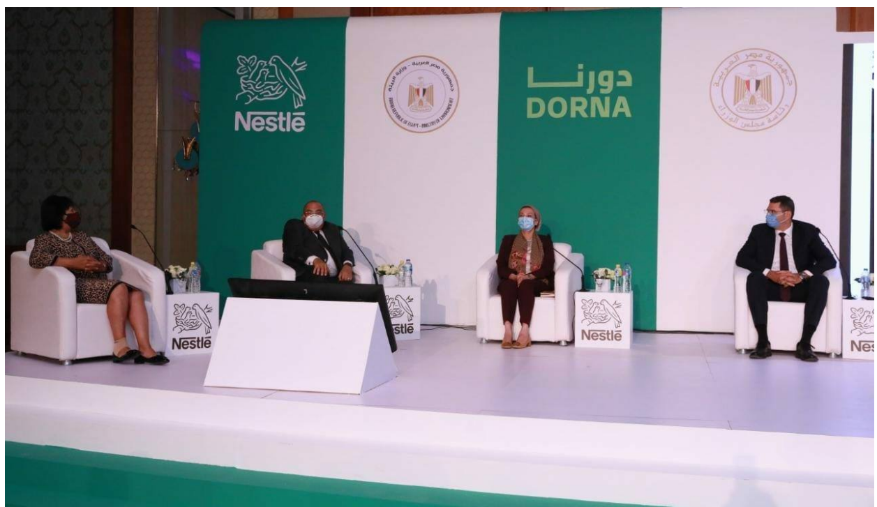
Posted on the Facebook page of the Ministry of Environment