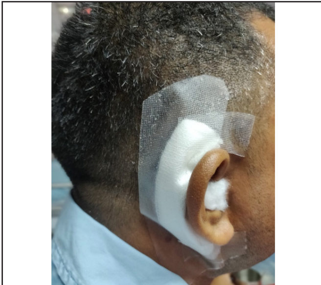
Fig. 1. A patient with single gauze piece dressing secured using adhesive tape.