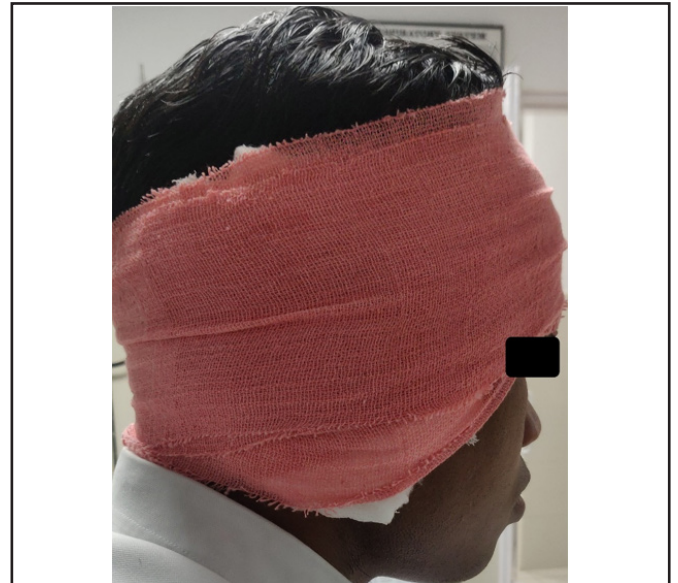
Fig. 2. A patient with conventional bulky mastoid dressing.

can only be accepted in India after due deliberation.