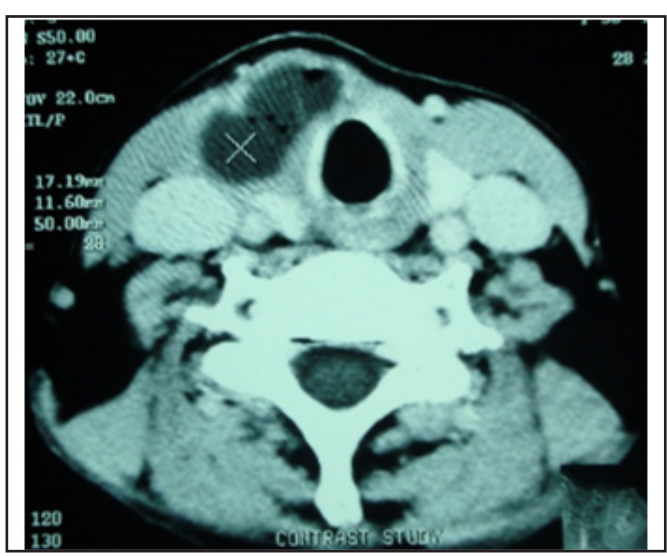
Fig. 2. CT scan axial section showing abscess in the right lobe of thyroid gland

We decided for surgical exploration of neck keeping in mind that right thyroid lobectomy may be needed. To our surprise we found out the foreign body, a 2.5 cm long wooden stick inside the abscess cavity at the right superior pole of thyroid gland (Fig. 3). We removed the foreign body with surgical debridement of the abscess cavity (Fig. 4). The patient had an excellent recovery. No complication was noted. Institutional Ethical Committee clearance and informed consent from the patient were taken prior to publication.