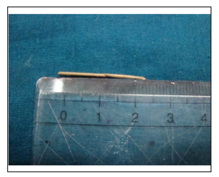
Fig. 4. Photograph of the retrieved foreign body (wooden stick)

Management migratory foreign body involves exploration of the neck by an external approach and removal of the foreign body. Exploration for a migratory foreign body has been described by some otolaryngologists to be like fishing for a needle in the ocean. The main difficulty during exploration is the localization of the foreign body in the soft tissues of the neck. The foreign body at the time of surgery may not be located exactly where it is shown to be in the CT scan