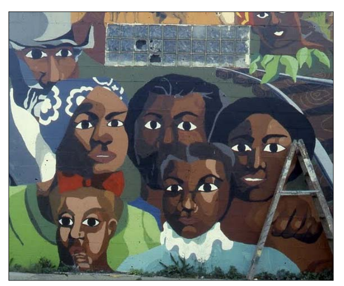
Detail, Park Street Mural, Champaign, Illinois. http://eblackcu.net/mural/

http://eblackcu.net/portal/items/show/106.