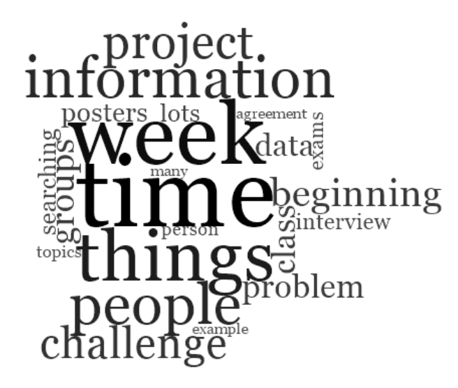
Figure 3. Word cloud of the problems and difficulties. Compiled by the authors.

people (27 references), project (27 references) and challenge (25 references).