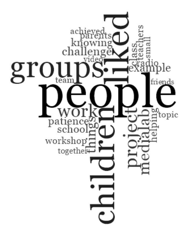
Figure 2. Word cloud of the positive aspects. Compiled by the authors.

We first obtained a word cloud using NVivo 11 with the goal of exploring what words appear frequently in the participants' discourse. As Figure 2 shows, the words that appear most frequently are: people (72 references), children (63 references), liked (49 references), groups (44 references), project (36 references), work (34 references) and Medialab (29 references).