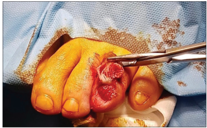
Figure 2b: Intraoperative photographs of onychomatricoma's excision. Ventral face of the nail plate showing parallel cavities