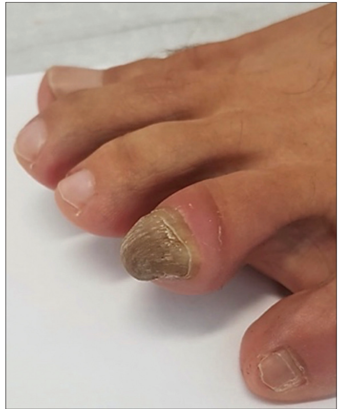
Figure 1b: Onychomatricoma on the fourth toenail of the left foot showing a thickened, over-curved, ridged, brown-yellowed nail. Lateral view

Fingers are more commonly affected than toes with a prevalence of 64%. 4 When the onychomatricoma reaches toenails, most cases are found in the big toe and sometimes in the second or the third toe. In 2015, Di Chiacchio et al. reported a large series of 30 onychomatricoma, where 11 cases were found on the toenails: seven in the big toenail, two in the second toe and two in the third toe. 4 In 2016, Coutellier et al. were the first to describe an onychomatricoma on the fifth toe of the left foot in a 68-year-old female. 5 We were unable to find any previous reports of onychomatricoma on the fourth toenail.