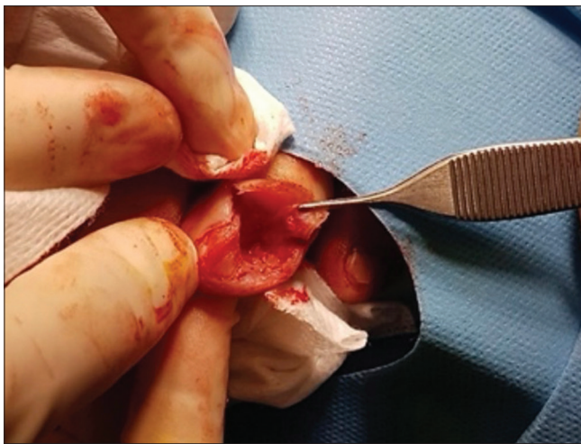
Figure 2c: Intraoperative photographs of onychomatricoma's excision. After complete resection of the tumor