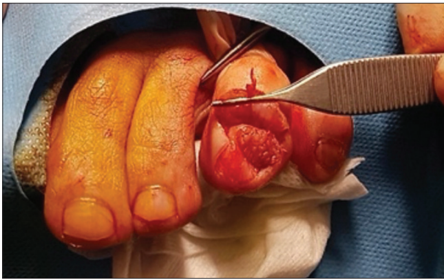
Figure 2a: Intraoperative photographs of onychomatricoma's excision. Tumor view showing digitiform projections of the nail matrix