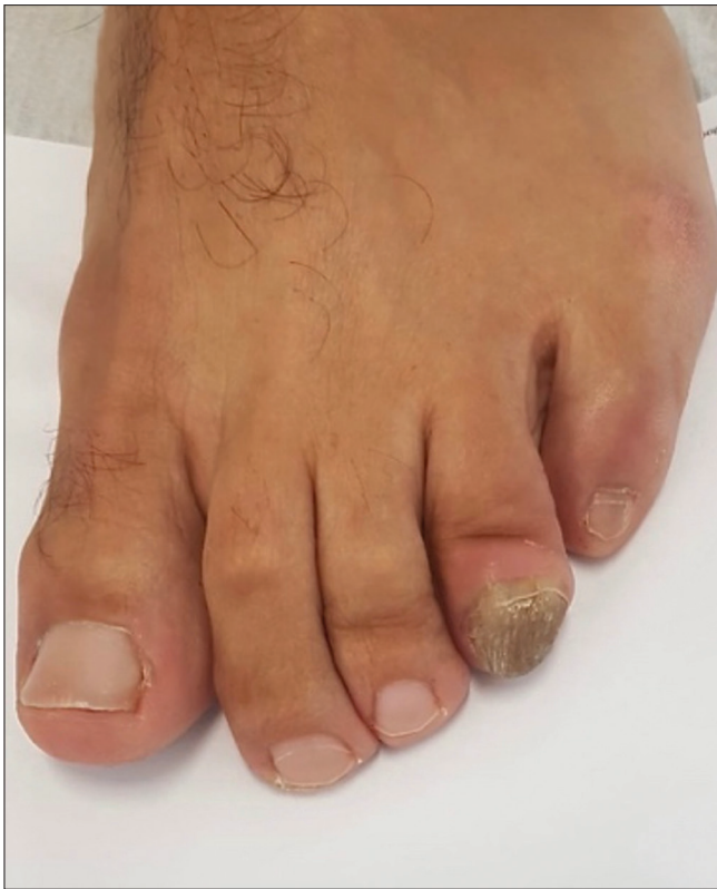
Figure 1a: Onychomatricoma on the fourth toenail of the left foot showing a thickened, over-curved, ridged, brown-yellowed nail. Front view