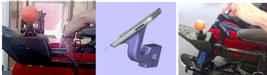
Assessing user needs

Over the summer months, WMG worked with Hereward College to design and 3D print an iPhone mount with a bespoke attachment for a student's wheelchair. There are numerous different wheelchair designs and different users require items such as iPhones to be attached in different positions, so this work provided an excellent example of how 3D design and print can help to produce bespoke user solutions. The design and 3D print process can be seen below: