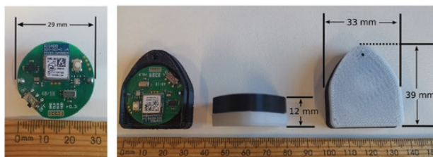
Figure 1. Sensor and casing dimensions.

The primary outcome measure in this study was falls rate, calculated as the number of falls divided by the number of participant bed days in the participating wards during the control and intervention blocks, and expressed as falls per 1000 participant bed