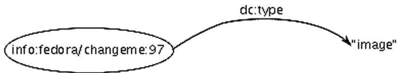
Figure 2. A fragment of the record shown in figure 1.

Figure 2 shows one RDF statement extracted from figure 1, our running example