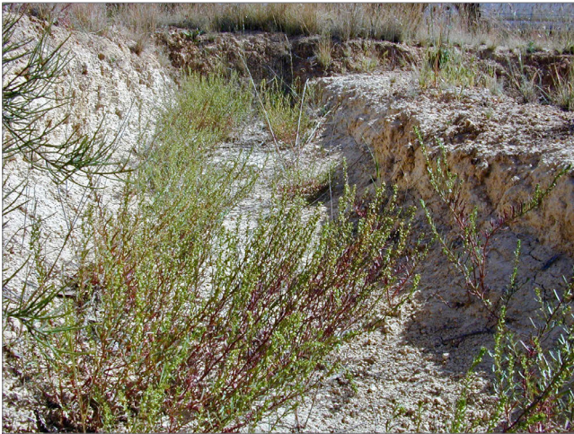
Figure 5. Natural recruitment of Haloragis eyreana in trenches six years after plants were translocated to crests.

Excavated trenches provided excellent soil-moisture conditions and protected plants from wind damage and drying. When ideal conditions were provided, plants had no difficulty in regenerating from seed, rootstocks and suckers.