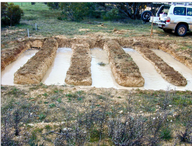
Figure 2. Layout of Haloragis eyreana translocation trial showing the four crests (H, L, H, L) and interstitial trenches on the day of translocation.

Edaphic amelioration provided an ideal micro-habitat for growth, flowering and recruitment of H. eyreana . In 8 years, the population was increased by over 1000 new plants regenerating at four new sites within the population range.