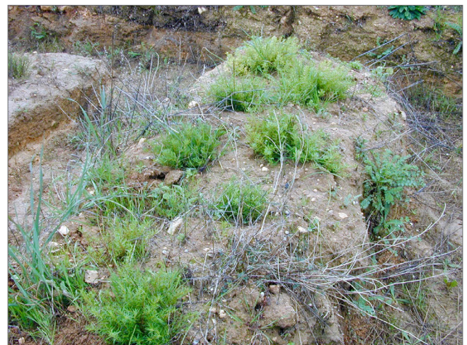
Figure 3. Haloragis eyreana transplants a year after translocation onto a high crest.