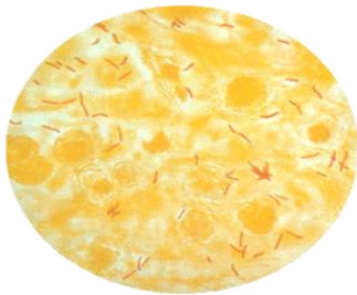
Fig 5: Mycobacterium Tuberculosis in Sputum

New TB Control Strategy by RNTCP ( Revised National Tuberculosis Control Programme ), DOTs ( Directly Observe Treatment Strategy)