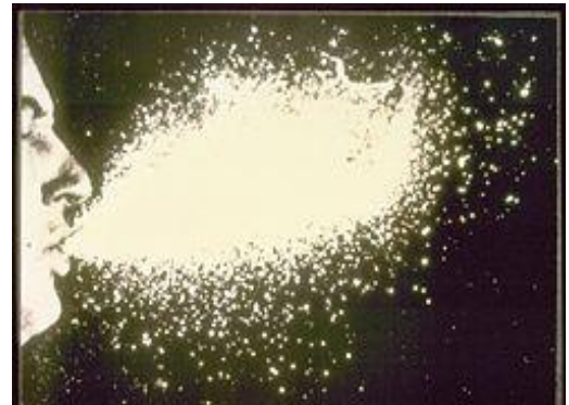
Fig 3: Tuberculosis is spread by aerosols created by coughing or sneezing

Unfortunately urban lifestyles make the job easy for the TB bacterium. Crash diets is one of the major factors that can trigger latent TB infection into a full blown disease. Among women, it is a major factor that trigger infection, along with jobs with long and erratic timings, such as those of BPOS (Business Processing and out sourcing). It's a menace that is making women lose their homes and forcing children to drop out of school. Tuberculosis has become one of Indian's worst enemies. Studies conducted on the socio-economic impact of TB have projected that over three lakh children are orphaned by the disease every year while over a lakh women are rejected by their families, once they contact this disease.