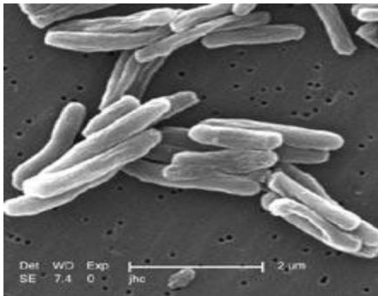
Fig: 2: Mycobacterium Tuberculosis

Stress, sleepless nights, smoking and crash diets have pushed up Tuberculosis infection among the urban 18 - 35 year olds, who now account for 60% of TB infections in several upscale hospitals and clinics. The disease shows a clear gender bias, with two in three patients with TB being young women.