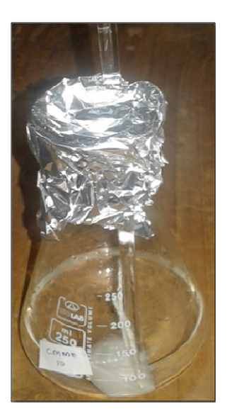
Fig. 2: In vitro experimental model setup