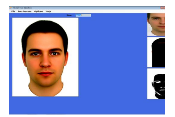
Fig. 6: Shows the output of the unmasking the face