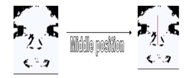
Fig. 3: Shows an mid position of the image

In the figure, X will be equal to the maximum width of the forehead. Then we will have an image which will contain only eyes, nose and lip. Then we will cut the RGB image according to the binary image.