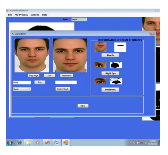
Fig. 7: Shows the output of the segmented images