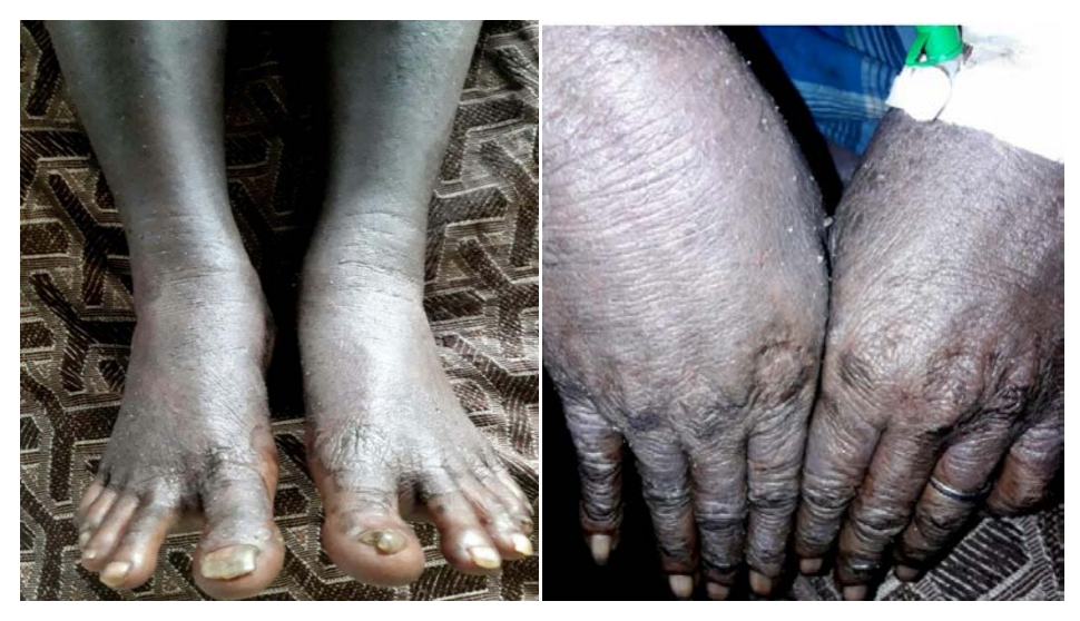
Fig. I: Erythematic lesions on both the extremities of the patient with metaprolol drug therapy

monophosphate (cAMP) and cell proliferation. Others like ACE inhibitors, frusemide, biguanides etc, could also cause psoriasiform eruptions all over the body [26, 27]. With the discontinuation of metoprolol, the lesions and eruptions were found to be reduced and there was no reappearance of lesions when treated with atenolol in its initial stage. This clearly depicts that the above case is drug-induced erythematous psoriasis with the involvement of nails and extremities. His history of events with beta-blocker therapy is given in table II.