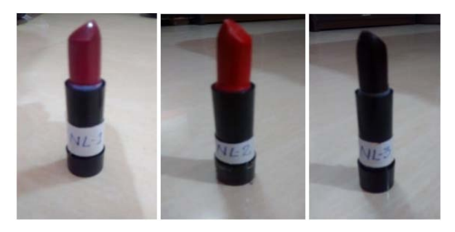
Fig. 3: Prepared natural lipsticks

The Bixin content was found to be 0.45% by HPLC (equipment and conditions are shown in table 2) Bixin peak appeared at 8.06 min. The final oil soluble dye was preserved in an amber coloured bottle kept in dark at ambient temperature.