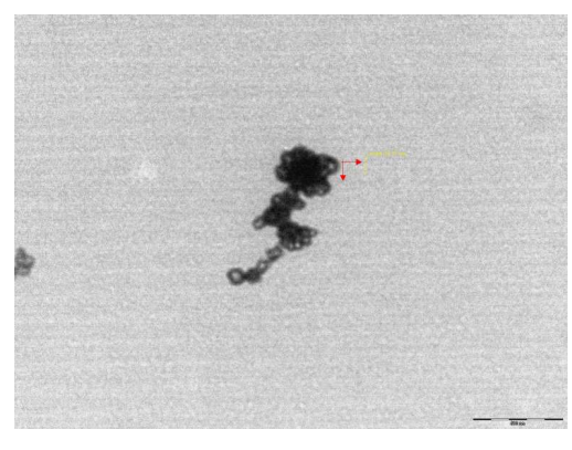
Fig. 1: TEM image of NZVI-CNS

TEM image of NZVI-CNS synthesized using the sodium borohydride method. The size and shape of the NZVI-CNS particles was determined by TEM analysis. A drop of aqueous N NZVI-CNS sample was loaded on carbon-coated copper TEM grid. It was allowing water to evaporate and dry completely for an hour at room temperature. The TEM micrograph image were recorded on a JEOL 1200 EX instrument on carbon coated copper grids with an accelerating voltage of 100 to 200 kV. The clear microscopic views were observed and documented in different ranges of magnifications. The nanoparticles were mostly spherical, triangular in shape and exist as chain-like aggregates. An accumulative size distribution survey of over 400 nanoparticles from TEM images suggests that over 80% of the nanoparticles had diameters of less than 100 nm whereas 50% were less than 60 nm (Fig. 1).