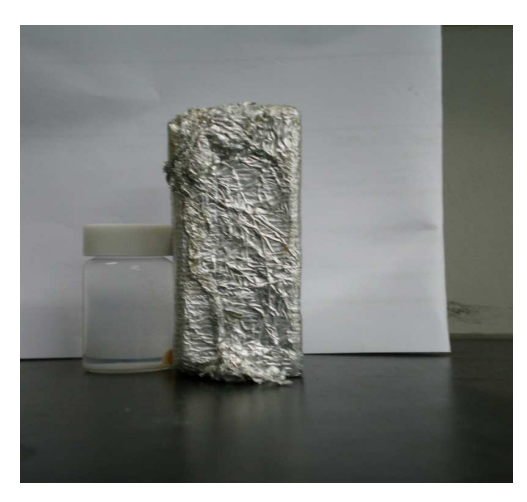
Fig. 3: Superparamagnetic behaviour