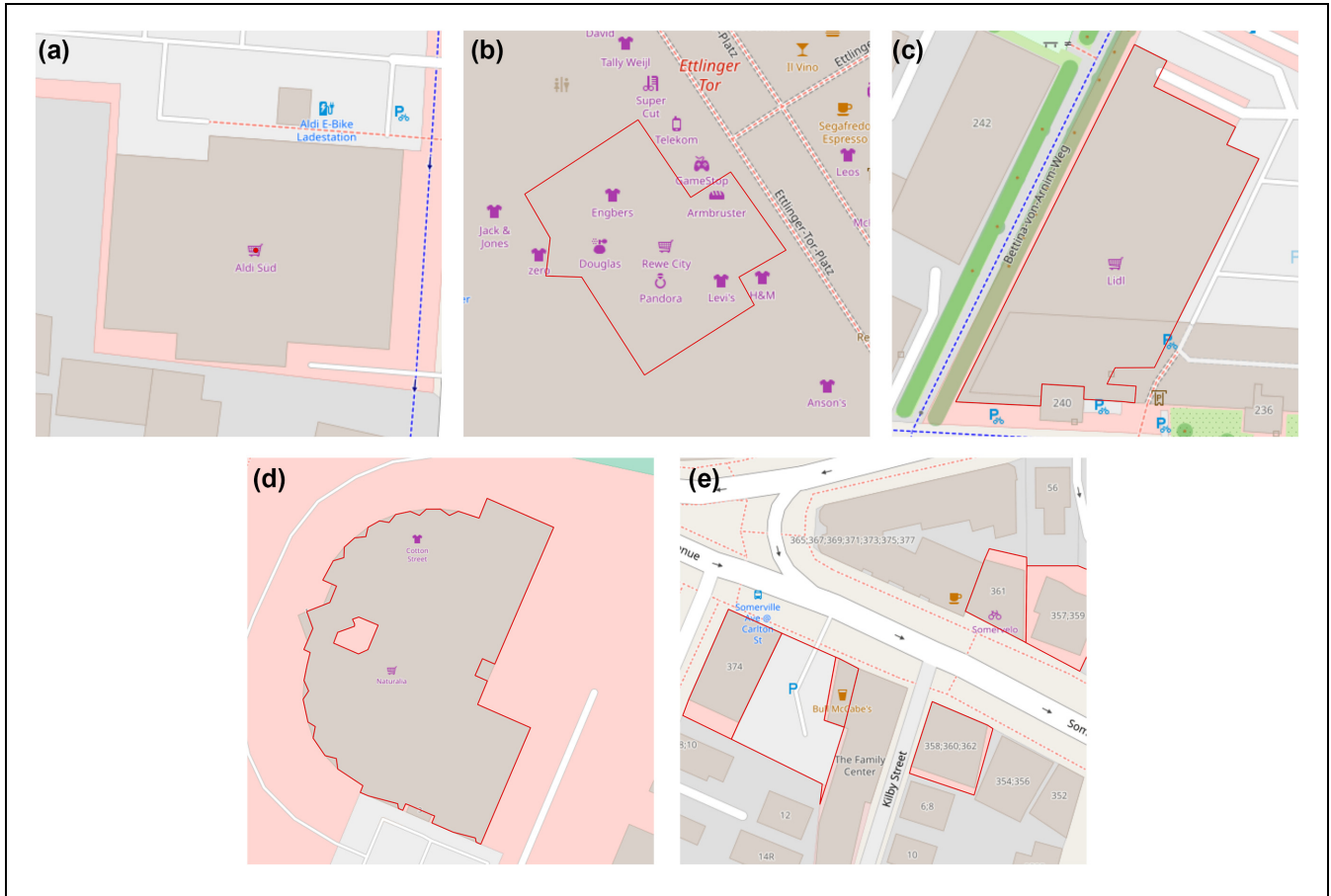
Figure 1. Different methods of modeling a supermarket: (a) as a node; (b) as an area within a building; (c) as a building; (d) as a relation representing a building; and (e) as an area of the land-use retail.

which is why there is still a need for research on the quality of POI data (18).