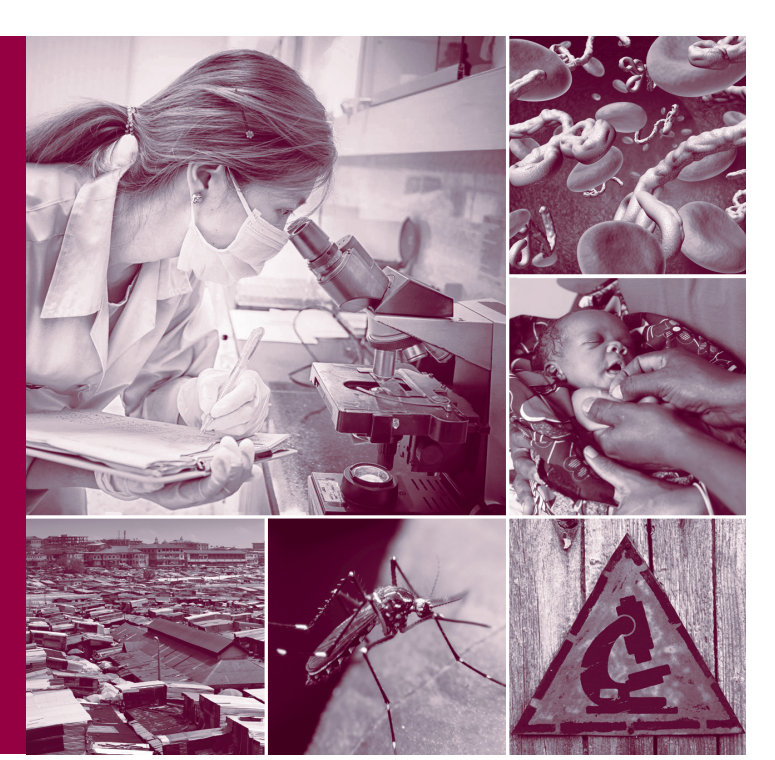
Cover photos clockwise