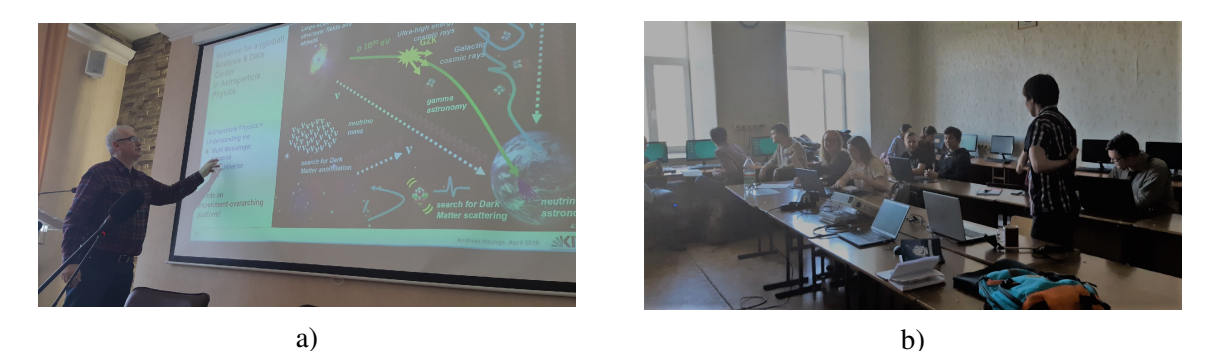
Figure 2: a) Dr. A. Haungs reads a lecture on multi-messenger astroparticle physics, ISU, DLC-2019; b) ISU students are analyzing open data as part of an event organized by the astroparticle.online portal.

Collaborations with ISSAP Baikal Summer School in 2018 and 2019 had a huge impact on the project, it inspired the authors of the astroparticle.online project to prepare lectures and seminars. Their videos were later published in the relevant sections of the site. More than 150 summer school students took part in the activities offered by astroparticle.online participants.