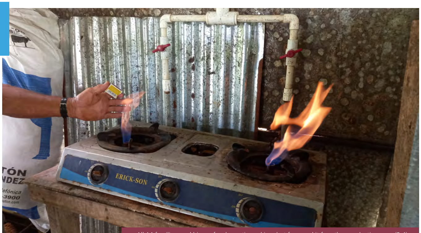
All 14 families used biogas for domestic cooking, but few used it for other productive uses. (2.4)

The project ultimately aims to build a multistakeholder partnership that will serve as a knowledge exchange platform to revive biogas technologies in Costa Rica. In the next steps, the findings will inform the development of capacity building activities to implement locally in the three communities, with the aim of replicating such activities in broader settings. The activities will be supported by the WISIONS pro-