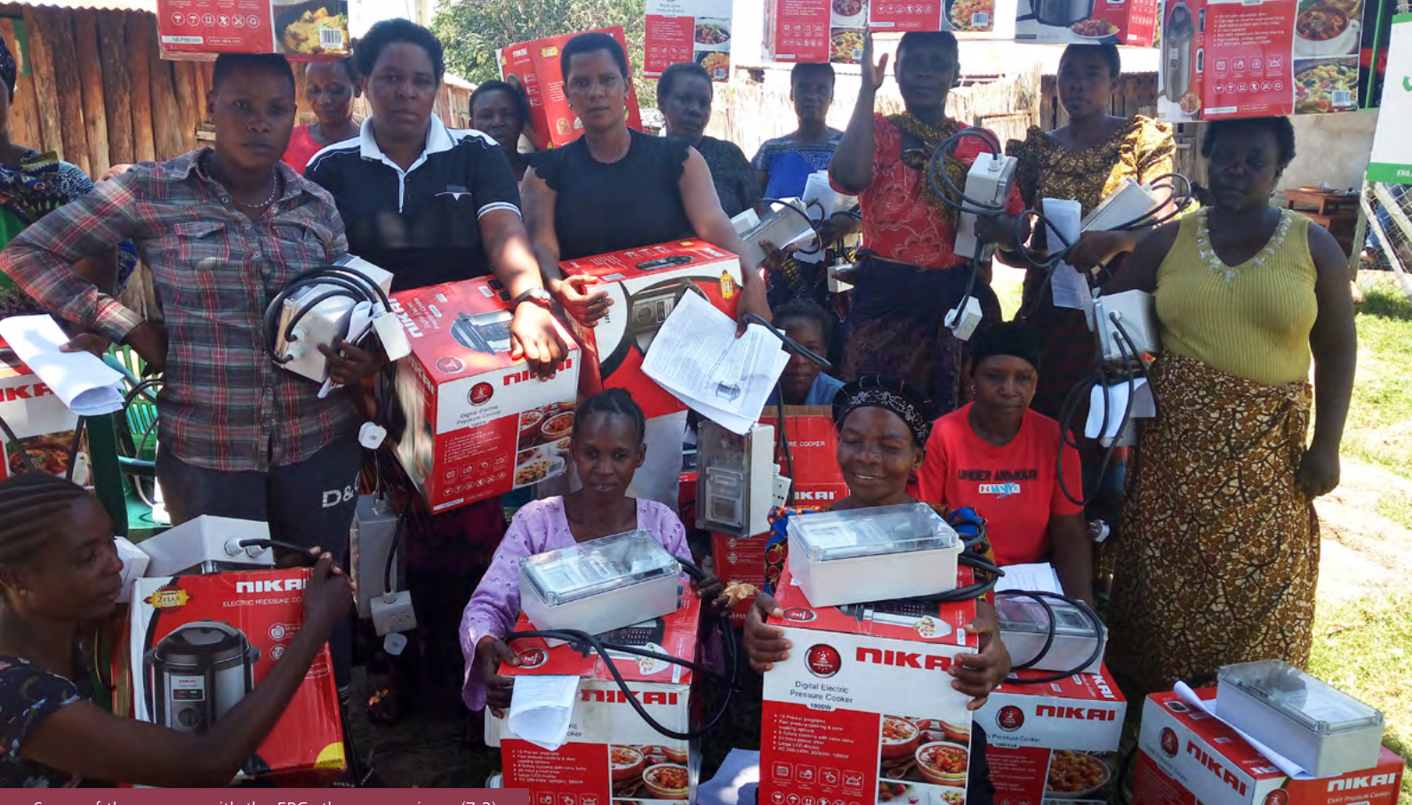
Some of the women with the EPCs they were given. (7.2)

reflecting the fact that the women have identified the costs and benefits enough to make a decision on whether to continue usage. Towards the end of the project, the Tanzanian government enforced a policy that reduced the tariffs paid for electricity to 100 shillings (0.04 dollars). With the costs of cooking reduced, pilot users begin to use their EPCs with renewed enthusiasm and the usage spiked to higher levels than when it was newly introduced.