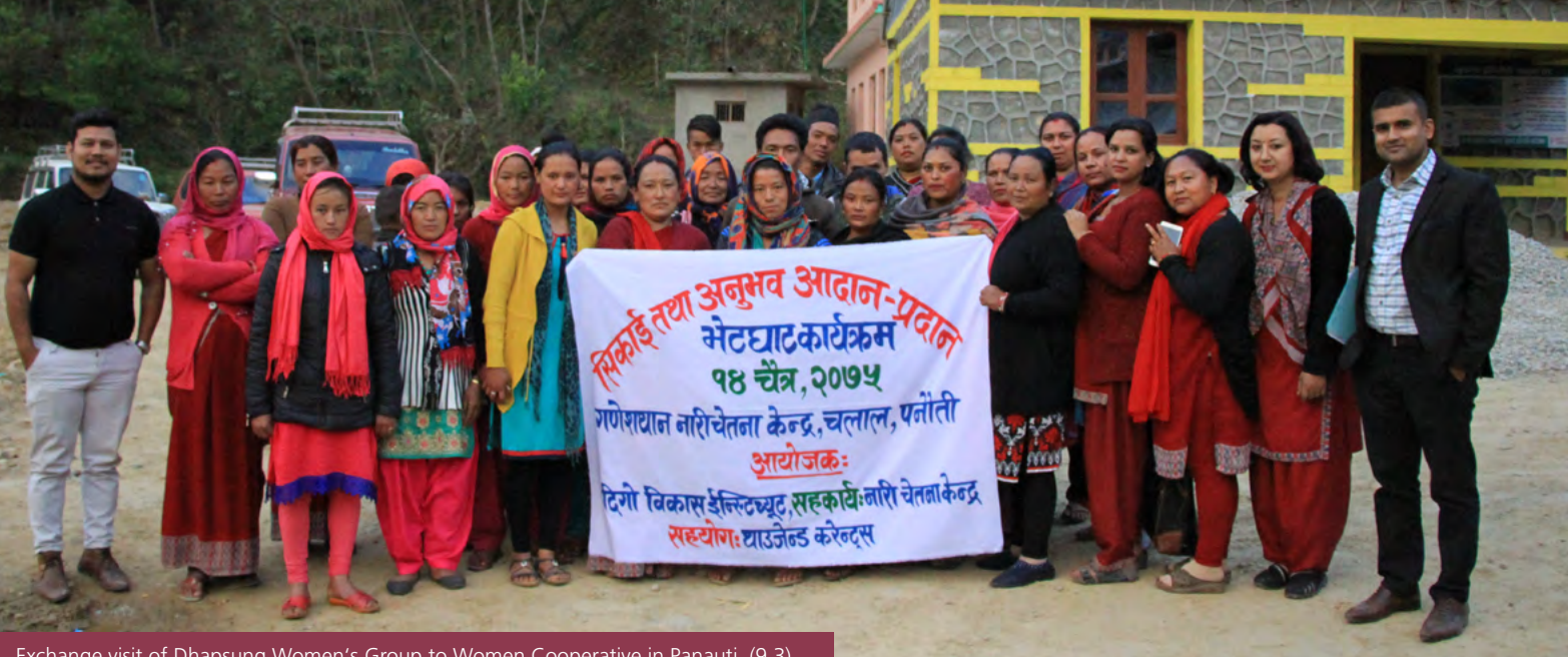
Exchange visit of Dhapsung Women's Group to Women Cooperative in Panauti. (9.3)

nical know-how of using it along with the grid. These kinds of scenarios exist everywhere in Nepal where after some years of mini-grid operations, national grid extensions become more feasible. DBI in consultation with the Rural Municipality and funds from the German Embassy proposed a prosumer model for the mini-grid. This is a grid-connected model where the community uses the electricity when needed and sells the extra energy to the national or local grid, thereby providing aid to the community's effort to foster economic development. However, the policy regarding community scale prosumer model is not in practice and donor agencies lack planning in converting community owned microgrids into prosumer models, from the planning to execution phase. Regardless, the 16kW Mini-grid is currently used to power a few lights at the nearby school, which is <1% of current capacity of mini-grid.