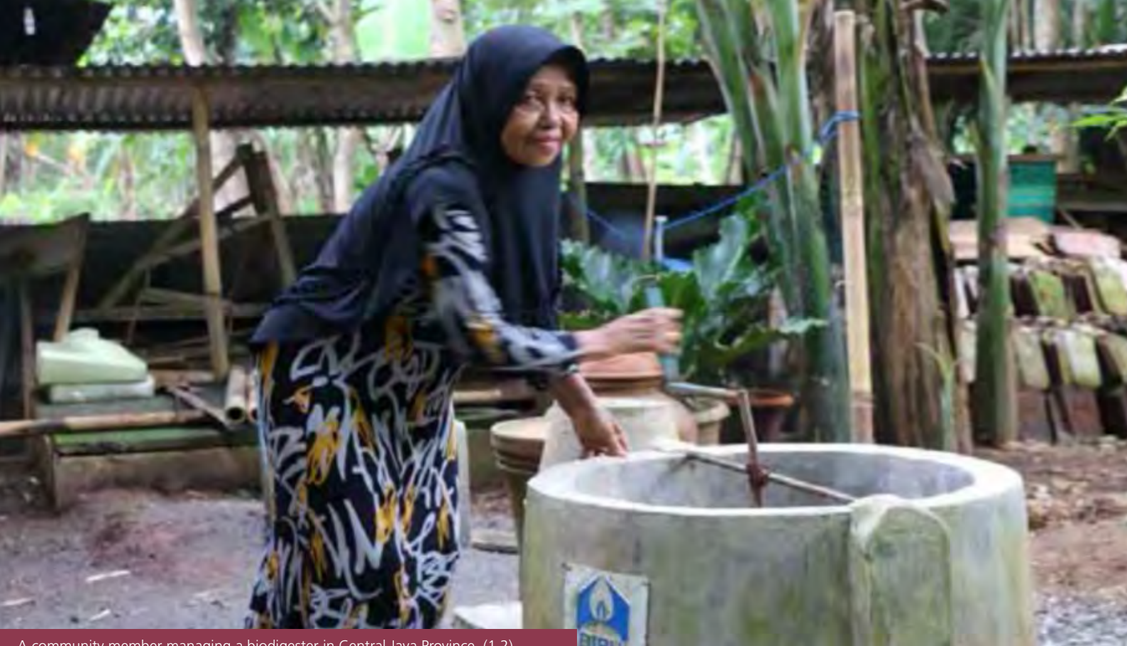
A community member managing a biogas digester in Central Java Province. (1.2)