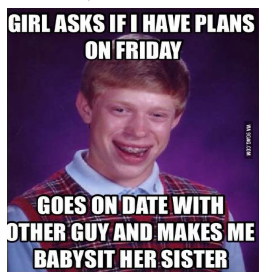
Bad Luck Brian Bad luck brian, bad luck.