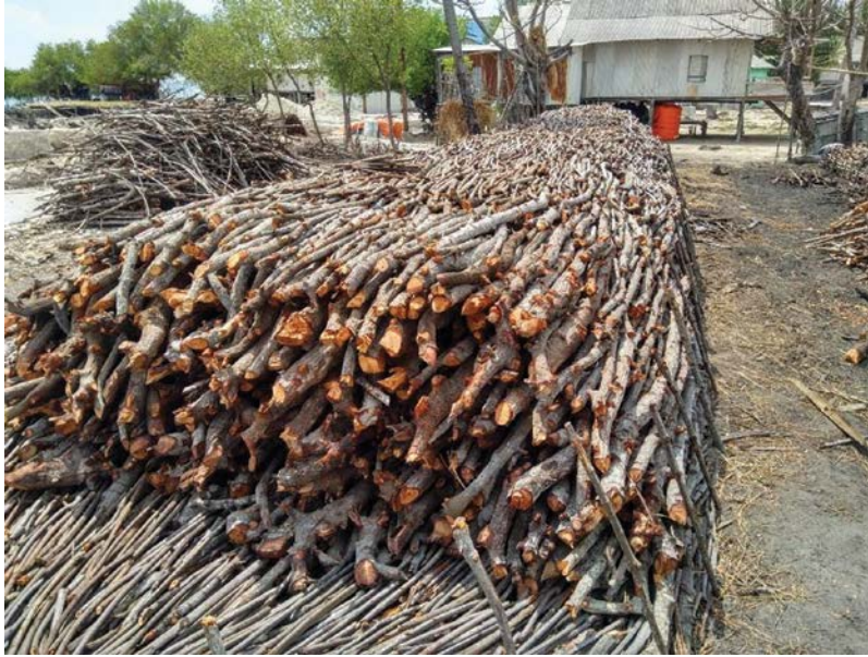
Figure 2 Local-scale mangrove harvesting for charcoal, Tanakeke Island, Indonesia.

became part of the tax or ‘tribute’ that indigenous communities had to pay the Spanish king (López-Angarita et al. 2016). Today, some small-scale charcoal production is conducted at the community level, which can have negative impacts on local mangroves if not regulated effectively (Brown et al. 2014; Figure 2). Most charcoal production, however, is produced through large forestry concessions, with complex supply chains that produce charcoal for national and regional markets. For example, Matang Mangrove Forest Reserve in Malaysia has been managed for forestry purposes since 1902, and produces as much as 179 tonnes of biomass per hectare each year from harvested plots (Ismail et al., 2017). Forestry production in Matang is not without consequence, however, as species diversity and wood yields have declined over time (Goessens et al. 2014).