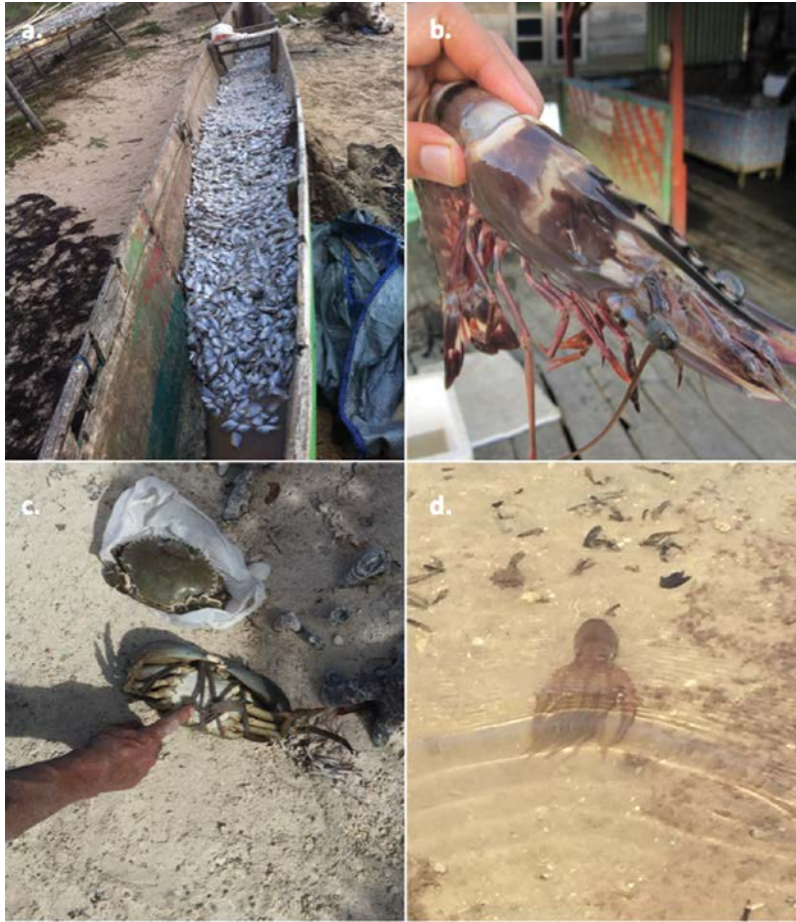
Figure 3 Examples of coastal wetland organisms used for food, including dried fish in Sulawesi, Indonesia (a); prawns in Sumatra, Indonesia (b); mangrove crabs in New Caledonia (c); and octopus in Madagascar (d).

valued at over USD $1,000 ha -1 yr -1 for fisheries alone (De Groot et al. 2012, Costanza et al. 2014). In many instances, the abundance and exploitation of food resources creates a number of livelihood opportunities (Siar 2003, Glaser & Diele 2004, Magalhães et al. 2007; Figure 3).