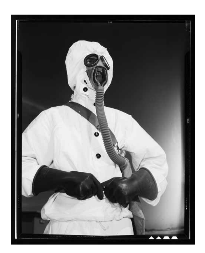
Figure 1. Chemical weapons are the most insidious of weapons, as their presence is not obvious. They are hidden from view, and they may be in the form of gases, liquids, and powders that lie in wait for unsuspecting military or civilian personnel. Their effects may be immediate in paralyzing a human or animal or cause a lingering death and lead to extensive environmental damage. Shown here is a photograph of a sailor wearing a protective chemical weapons suit.

Biological weapons are categorized into three basic types: spore-forming bacteria; vegetative bacteria (nonspore-forming); and viruses (Stuart, 2005). Studies have indicated that survival of these agents increases in air, water, textiles, and in soil (Stuart, 2005). Biological weapons may be more harm-