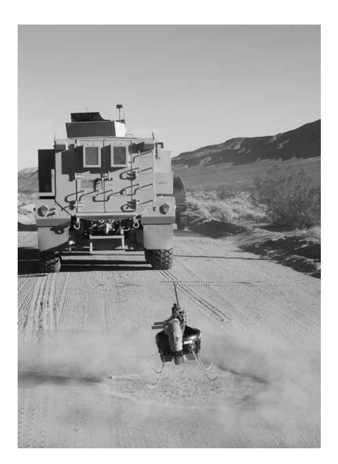
Figure 2. As military planners, scientists, and engineers as well as terrorists develop new weapons, researchers are looking for ways to counter those weapons with new technologies. Shown here is a Foster-Miller Talon Mk.II searching an area while a Micro Air Vehicle (MAV) provides a 360-degree view as the two work together to search for a simulated improvised explosive device. [See www.navair.navy.mil/naw-cwd/nawcwd/media_galleries/photos/photos_technology.htm]

A relatively new development that has appeared in the wars in Iraq and Afghanistan are IEDs or "improvised explo-