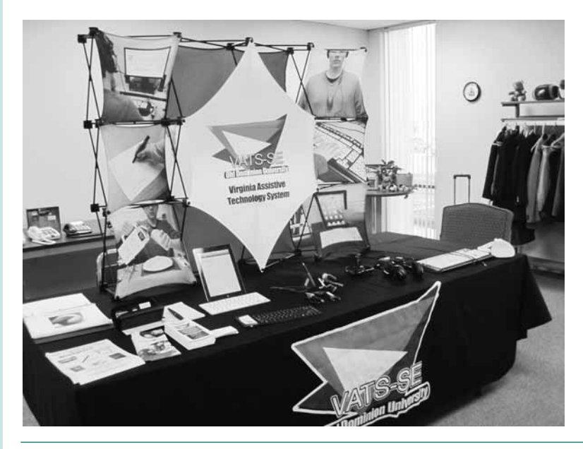
Photo 3. Shown is a display of assistive technologies that can be used to solve a wide range of assistive needs. Several examples of the technologies illustrated are digital pocket magnifiers, iPad® with special apps to facilitate vision, adaptive holders for holding containers, flexible keyboards and keyboards with large contrasting (yellow) key caps, and other devices. Each of these devices offers solutions to accessibility issues that individuals and military veterans may have.

fiberglass. When the appliance is ready to be painted, they will mix paints to find the right pigmentation and then polish the finished device, using grinding and buffing wheels. Students will use a number of different instruments and fixtures to test the