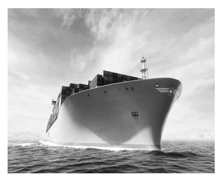
Figure 1. The Maersk's Triple E is the world's largest container vessel. It represents a milestone in improvements in fuel efficiency and environmental friendliness. The ship achieves its efficiencies through innovative design features such as a smaller twin-engine and twin screw design. While the Triple E cruises the oceans at slightly slower speed than its counterparts, it does so with a nearly twenty percent increase in fuel economy.

In a project supported by the Port of Long Beach, Toyota, and Tokyo-based shipping company NYK line, a greener, more efficient ship has been launched. Propelled by solar panels, the Auriga Leader is the first ship to use solar energy to power its main electrical grid. There are 328 panels that