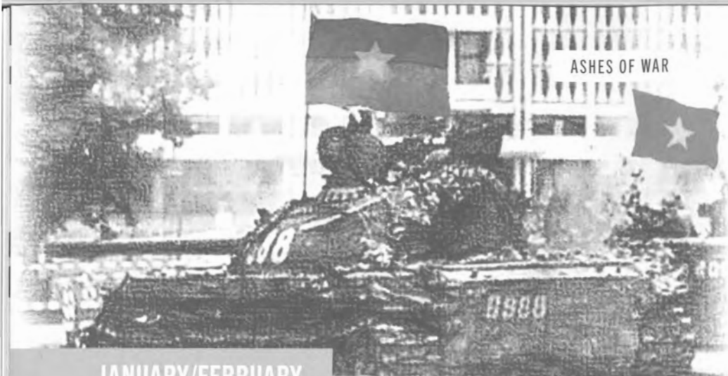
ASHES OF WAR