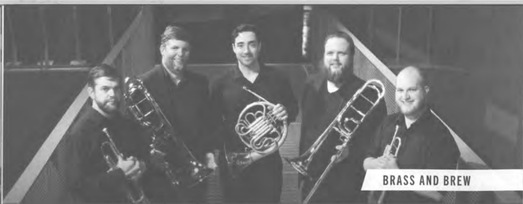
BRASS AND BREW