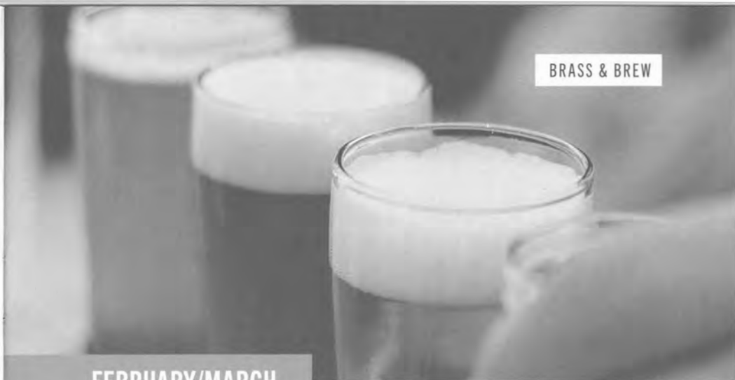
BRASS & BREW

Wednesday, February 7, 2018 2:00 p.m. Pensees Bookshop 502 6th Street Charleston, IL 61920