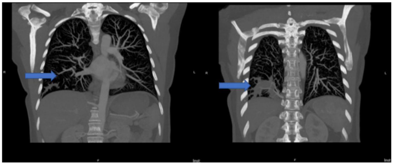
FIGURE 2. Axial CT scan of chest with IV contrast further demonstrating the separate blood supply of the sequestration.

basal, and some of the medial basal segments of the right lower lobe of her lung (Figure 2).