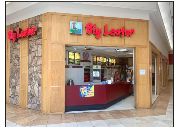
THE BIG LOAFER, LOCATED IN THE HUNTINGTON MALL FOOD COURT.

If I were craving the roll and pepperoni combo that many WestVirginians love, I would most likely go to the Big Loafer or a local restaurant that puts their own twist on the staple. But it is also important to realize and appreciate the history of the original pepperoni roll, even if it is not your preferred style.