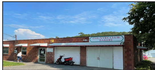
COUNTRY CLUB BAKERY IS LOCATED AT THE ORIGINAL BAKERY IN FAIRMONT, WV.