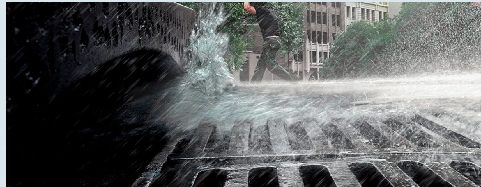
Rainwater hitting a stormdrain in Seattle, WA

Some effects are acutely lethal, as is the case for adult coho salmon, where pre-spawn mortality rates in urban streams can be as high as 90% (Scholz et al. 2011; Tian et al. 2021). These fish end their years-long journey to the ocean and back with their bellies still full of unfertilized eggs, missing their single chance to spawn. For coho, it appears that pre-spawn mortality is linked to the human transportation network, where contaminants, like tire wear leachates, are generated (Feist et al. 2017; Tian et al. 2021). Development expansion and increasing use intensity of the built environment is thus significantly impacting the long-term viability of local coho populations, with far-reaching ramifications for both freshwater and marine food webs alike. And while it is tempting to focus on lethal impacts to iconic species such as coho, road runoff is similarly lethal to lower trophic level organisms, such as mayfly larvae, sea urchins, and amphipods, which all play important roles in upholding marine, freshwater, and terrestrial food webs (Anderson et al. 2007; Kayhanian et al. 2008; McIntyre 2015).