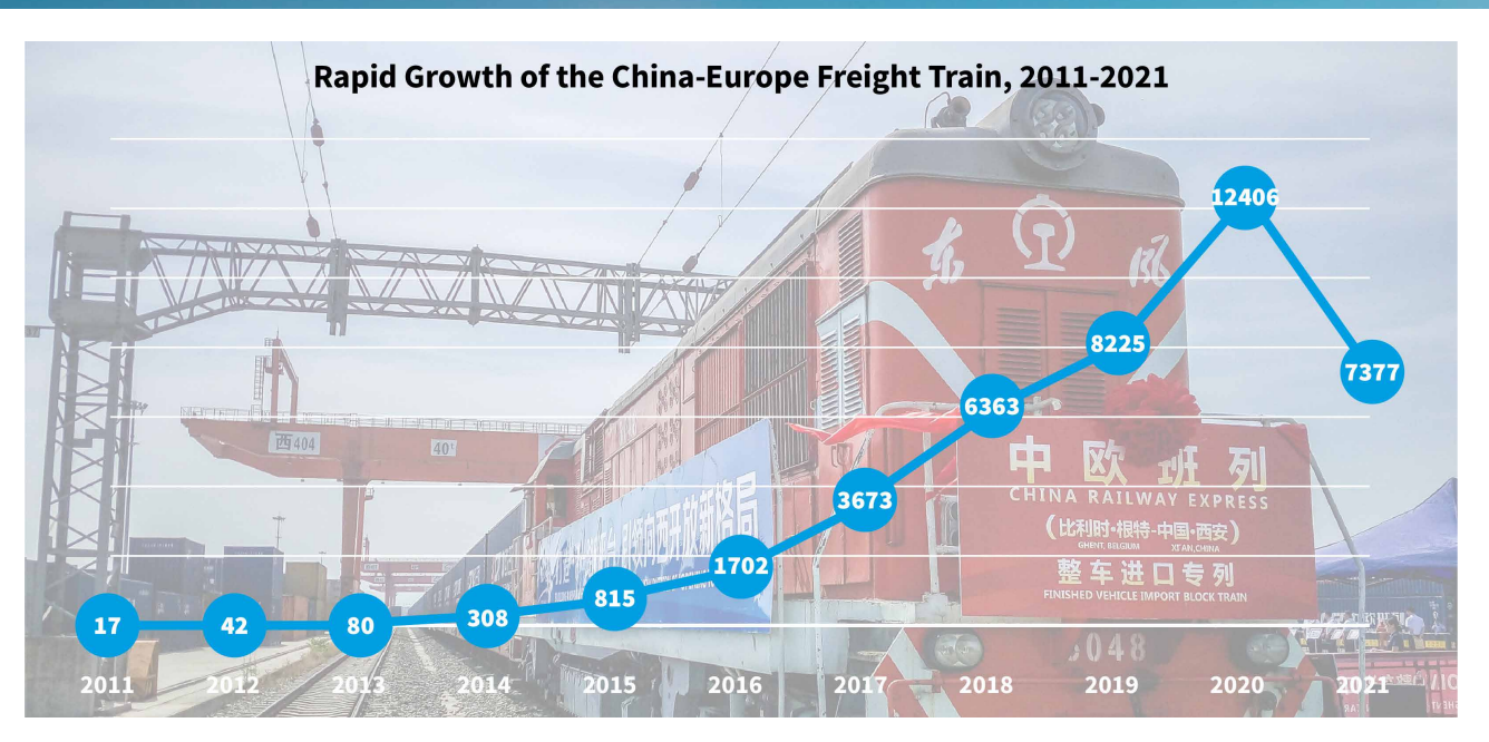
Data for 2021 refer to the number of freight trains during the first six months.

globalisation, urbanisation and development, underpinned and connected by mechanisms of connectivity, infrastructure and sustainability, aggregating into a synergistic force for largescale change.