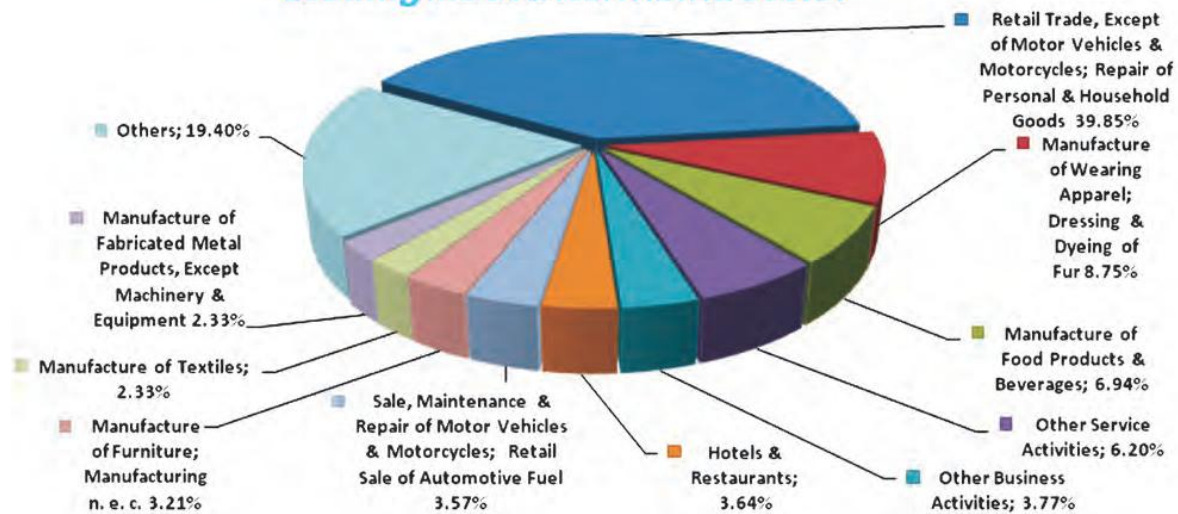
Figure no.1 Leading Industries of Micro, Small and Medium Enterprise

Source: Annual Report 2014-15 Govt. of India, Ministry of Micro, Small and Medium Enterprises