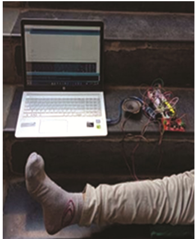
Fig. 2 — Subject performing Exercise

The Biofeedback device is designed with the help of sensor connected to the device and it is able to sense the pressure or force applied and displays the number of right and wrong counts done by the patient and the voice play back module which has speaker and buzzer connected to it provides a clear audio feedback. Fig.2 represents a subject performing quadriceps exercise. Fig 3 shows LCD display of subject performing exercise. LCD display showed in Fig. 4 display readings which is taken after a cycle of exercise and represents the number of wrong and right