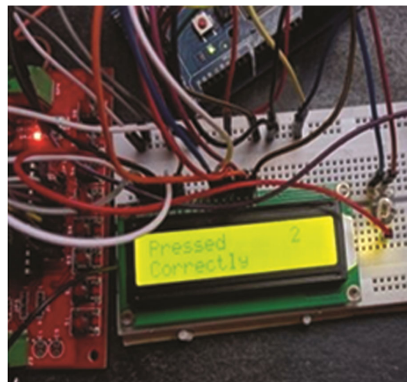
Fig. 3 — LCD display showing performance of Exercise

counts. Audio feedback functions during pressing of sensor or at time of exercise speaker counts from 1 to 10. Once when one cycle is completed without break speaker says 'correct'. When there is a wrong pressure in the middle of the cycle, buzzer is activated. Visual feedback functions as when performing the exercise yellow LED glows, when once cycle is completed without break blue LED