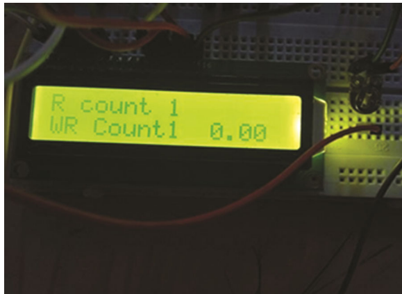
Fig. 4 — Display showing exercise count.

glows, when there is a wrong pressure in the middle of the cycle red LED glows. In LCD time taken to complete one cycle of the exercise is displayed. The number of right counts and number of wrong counts done are also displayed.