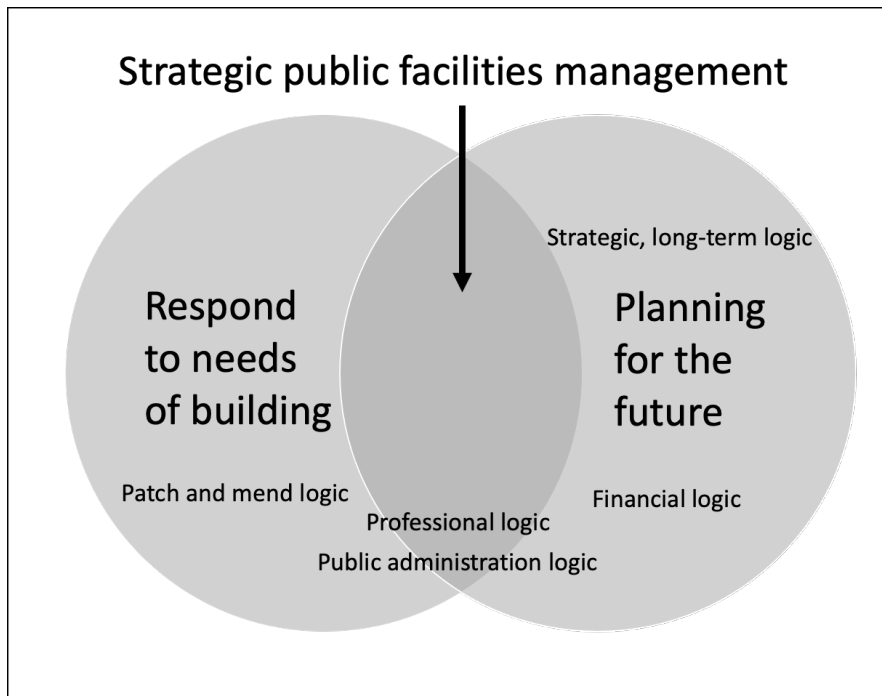
Figure 3. Practices and logics of SPFM

Following the notion that it is not the presence of logics per se that determines the outcome of a new practice implementation but rather how these logics are acted upon in practice (Hemme et al., 2020; Lindberg et al., 2014), it becomes possible to discuss how the old and new practices of PFM and their different associated logics coexist in PFMOs. My studies have shown how the old practice of PFM is strongly connected to the ‘patch and mend’ logic—one that is no longer wanted, especially by managers and those occupying places higher up in the organizational nexus of changing practices for SPFM. In Paper IV, how practices associated with a private logic were favoured and contrasted to the ‘patch and mend’ logic as well as public administration logic is shown, suggesting that the logics of SPFM are competing rather than facilitating each other (cf. Goodrick & Reay, 2011).