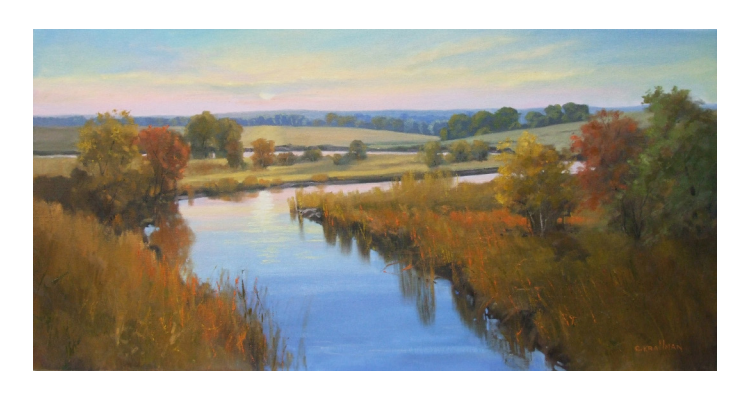
Blue Moon Over Dragoon Creek Cally Krallman

*The length of the Santa Fe Trail was around 800 miles (National Park Service) depending on which route was traveled. Parker traveled approximately 600 miles further to Chihuahua, Mexico, several times.