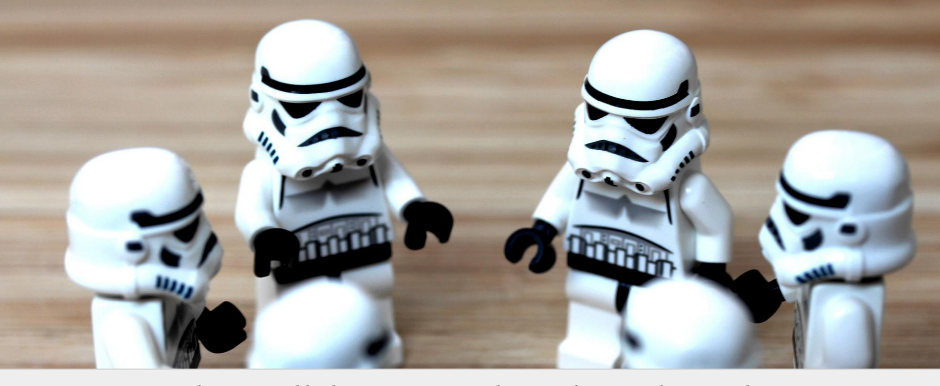
Level 3: Collaborating (directly with students)