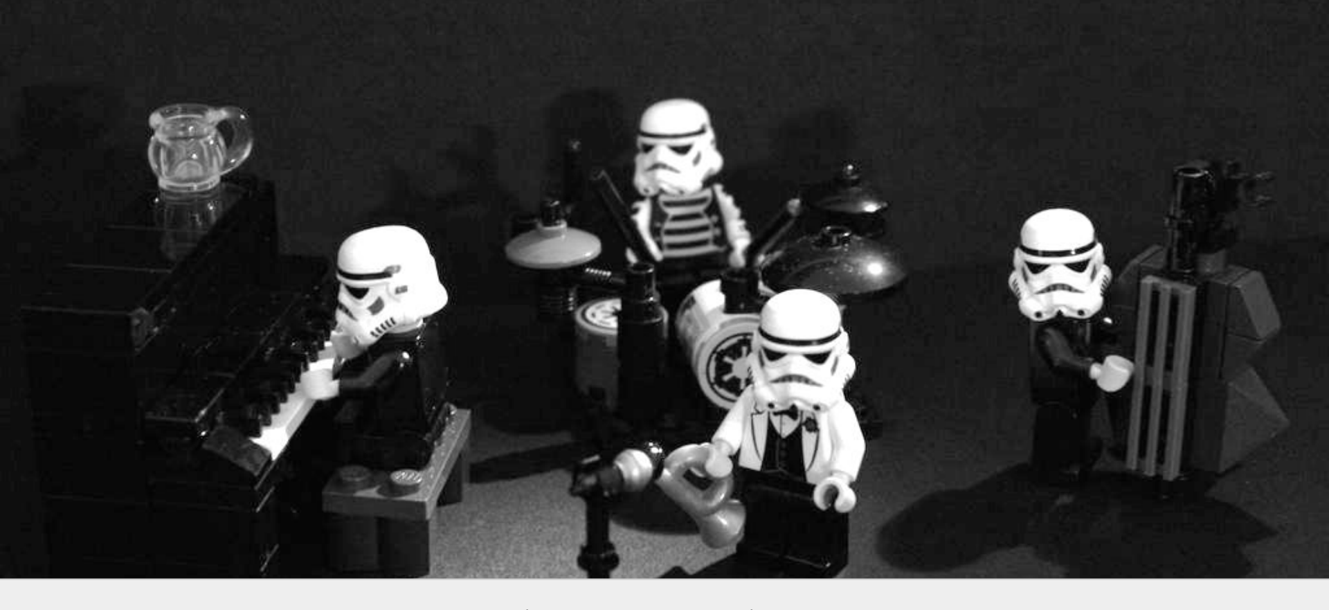
Recommendations and Best Practices