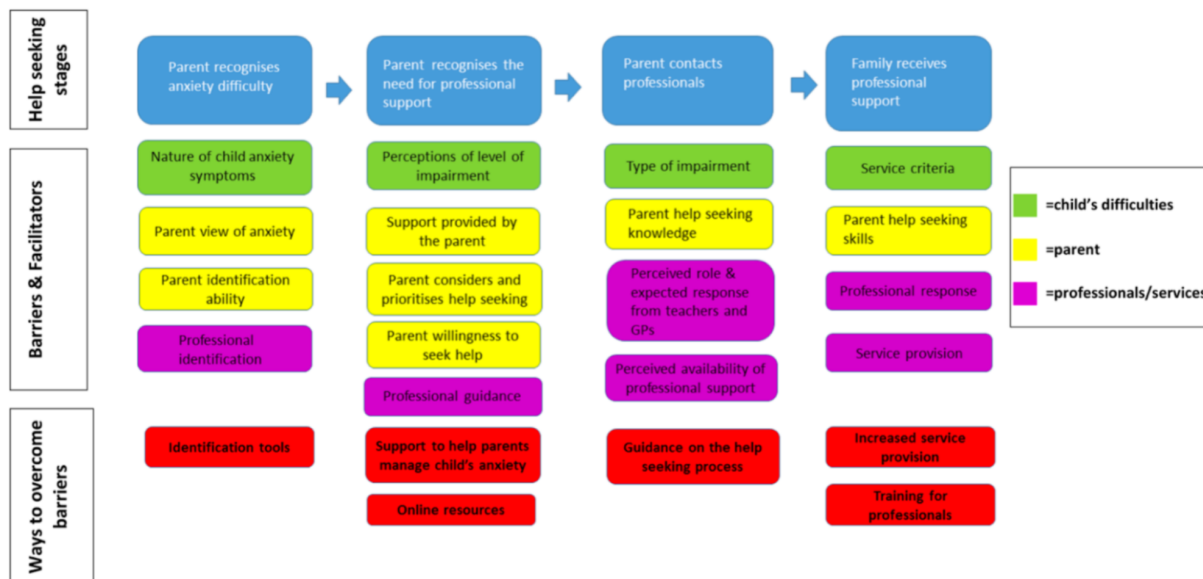
Figure 2. Barriers and facilitators at four key stages of the help seeking process

Note: Retrieved from Reprinted from What do parents perceive are the barriers and facilitators to accessing psychological treatment for mental health problems in children and adolescents? A systematic review of qualitative and quantitative studies by Reardon and colleagues (2017).