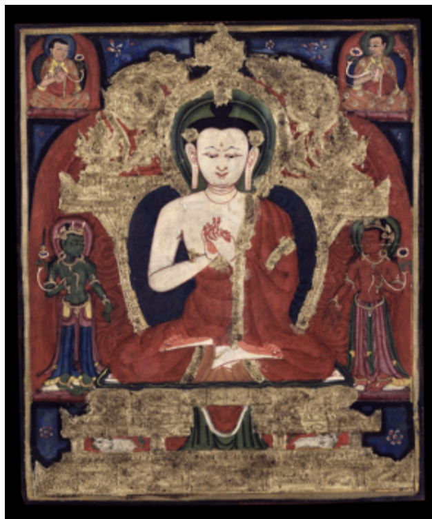
(Figure 4) Buddha - (Vairochana-like Appearance) , Western Tibet, 1300-1399. Raised Gold on Cotton. 25.40x20.32cm. Rubin Museum of Art

In paintings, color choice is crucial when representing Buddhist deities. Since we cannot identify the color from sculptures and stone carvings that have lost their pigments, let's take a