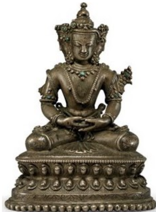
(Figure 5) Tibet, Vairochana, 4 Faces . 14th-15th century, Tibet, Vairocana, copper alloy with stone inlay.

carving (Figure 2). This statue is even more lavishly decorated than the ones we saw before, partially due to the abundant and rich aesthetic of Tibetan art. Vajradhatu Vairochana's iconographical attributes consist not only of a crown and jewelry around his neck, but also beads around his arms and legs. Again, the statue does not retain its original pigment, but Vajradhatu Vairochana also appears to be white. The additional three faces may be green, yellow, and red 18 . This form of Buddha Vairochana also appears in mandalas and other paintings.