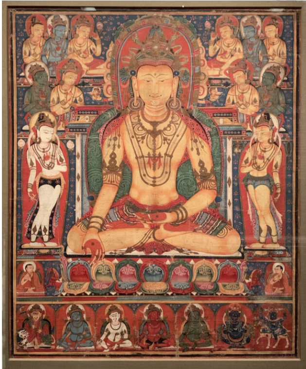
(Figure 13) Buddha Ratnasambhava with Wealth Deities . Tibet, early to mid-14th century. Pigments on cloth. Rubin Museum of Art.

Ratnasambhava and the Wealth Deities (Figure 13) is a great example of Buddha Ratnasambhava's family. We can see that the Buddha and the surrounding deities are adorned with an abundance of jewelry, which signifies not only the material wealth of our world, but also the merit and preciousness of Buddhism. All the secondary deities, besides the seven at the bottom of the composition and two gurus beside the lotus throne, direct the audience's attention to the main deity, which is Buddha Ratnasambhava with his boon-granting hand gesture, the varada