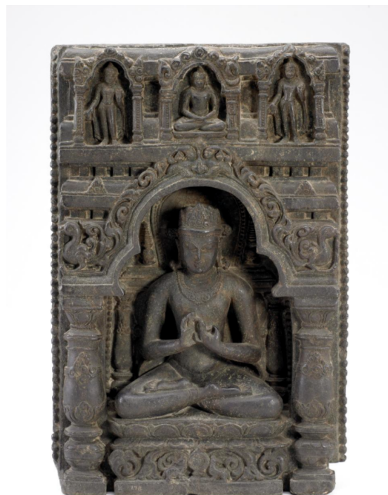
(Figure 3) Vairocana Buddha Pala-Sena Dynasty, 9th-10th Century. Stone Carved. H x W x D: 40.6 x 27.2 x 9.6 cm. Smithsonian American Art Museum.

evolution of his appearance. Figure 3 is a stone carving of crowned Vairochana from the Pala era in India, ca. 9-10th centuries. The gesture, hand mudras , and smooth style of the bodies represent the yogic ideal, as there is no articulation of the muscles of the deity and the depiction of the fleshy forms are round and smooth. However, the halo is missing from this statue. The stone carving shows Vairochana seated on a throne with flaming motifs around his head, and two birds at either shoulder. The three smaller deities above are hard to identify due to their size, but they possibly represent Buddha Shakyamuni in dhyana mudra , or the meditating hand seal 15 . The deity directly above the central figure in Buddhist art is often closely associated with the central deity. Sometimes a wrathful central figure will have a serene figure at the top; other times, Gurus will have images of the deities they embodied. The two standing figures with the long monk robes are likely Buddhas, since their right palms face outward and point down and their left palms face outward but point up, which is a common gesture of Buddha.