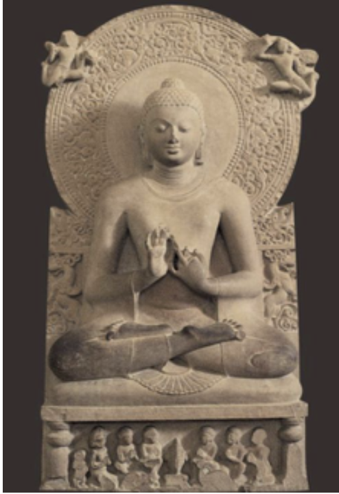
(Figure 2) Seated Buddha Preaching First Sermon . Sarnath, India, Second Half of 5th Century.

The abundant jewelry in this figure style is characteristic of Tibetan Buddhist icons. We can also see the difference by comparing it with a statue of the Historical Buddha (Figure 2) which marks the maturation of the style in India. While this statue from the fifth century of the