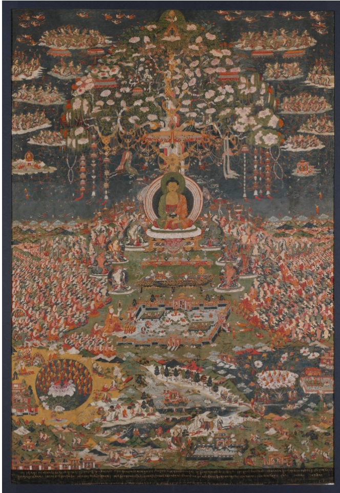
(Figure 11) Amitabha, the Buddha of the Western Pure Land (Sukhavati) . ca. 1700. Central Tibet. Distemper with gold on cloth. Paintings. 56 1/4 × 39 1/2 in. Metropolitan Museum of Art, New York. 2004.139.

decorations, such as the hanging ornaments, umbrellas, and clothes of other deities appear to be red in contrast with the green color of nature. Also, we can see that upon his meditating dhyana mudra , a jar is placed above his hand. The object varies in different paintings, but generally, art of Five Buddha Families depict the deities holding less objects. We can nevertheless still see that the iconography identifies the main deity as Buddha Amitabha. This painting is extremely rich in detail, but since our main focus is on the Five Buddha Families, we will only focus on the main deity in this painting for now.