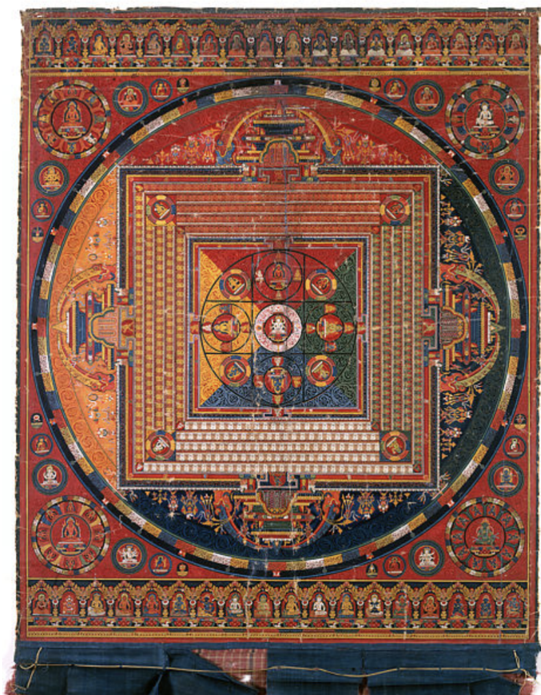
(Figure 16) Vajradhatu (Diamond Realm) Mandala . 14th Century. Central Tibet. Gold and Distemper on cloth. 29 1/2 in. × 36 in. Metropolitan Museum of Art, New York.

Let us look at another beautiful mandala of the Five Buddha Families. Housed in the Metropolitan Museum of Art, the Vajradhatu Mandala (Figure 16) shares many similarities with