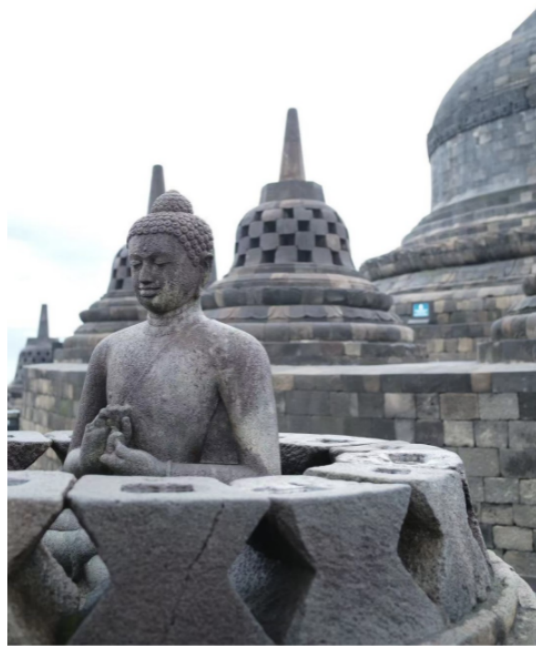
(Figure 19) One of the two revealed Buddha Vairochana sculpture inside the smaller stūpas of Borobudur.

side squares. Notice the inner three rings of circles, which are three tiers of smaller stūpas around the central large one. Inside each small stūpa is a statue of Buddha Vairochana in dharmachakra