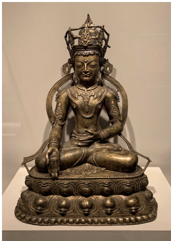
(Figure 14) Buddha Ratnasambhava . Central Tibet. 13th century. Brass with traces of pigments. Rubin Museum of Art.

Vajrayana Buddhism as the original Cosmic Buddha, and Buddha Amitabha is famous for his Western Paradise. Wealth deities, such as Buddha Ratnasambhava, are always popular among esoteric schools. Therefore, they appear more frequently in art. Hence, we will discuss the arts of Buddha Amoghashiddi in later paragraphs along with the Five Buddha Families.