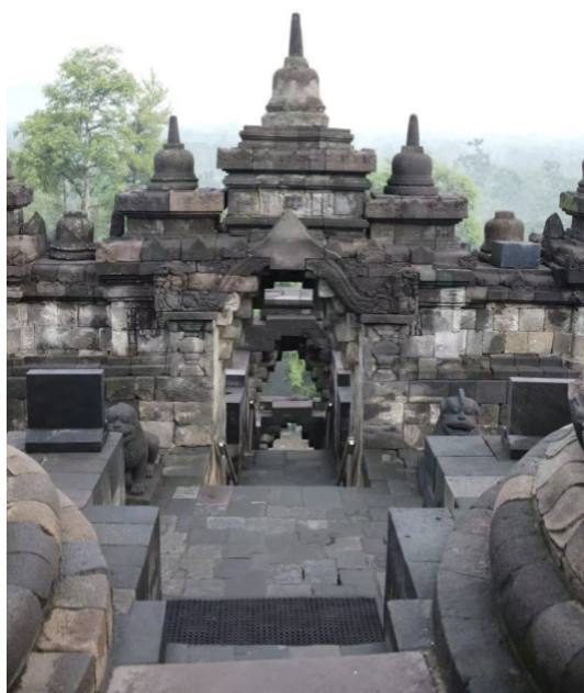
(Figure 20) Doorways of Borobudur.

To physically engage with the mandala as a three dimensional architecture in Borobudur is crucial to the comprehension of this Buddhist site. In January 2020, I visited Borobudur and immersed myself into this real-world Vajradhatu mandala . The experience of traveling from the bottom to the top through the gateways (Figure 20) was very similar to the layout in the painting. The religious meaning of this “journey” is to reach enlightenment through the blessed place by the Five Dhyani Buddhas. By climbing and circling around the architecture, one can gain much blessings. However, by only understanding the iconographic meanings of the design of Borobudur, one can acquire the full empowerment of the esoteric Five Buddha Families.