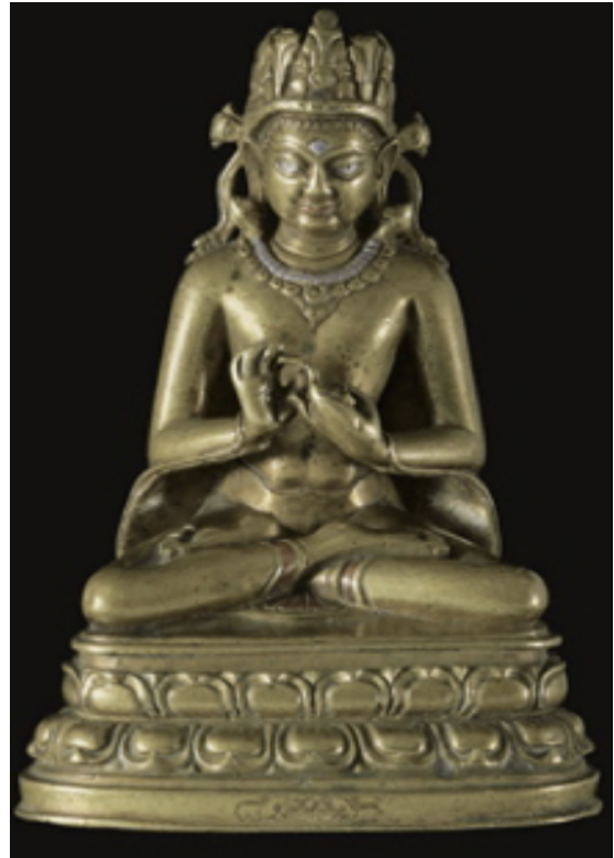
(Figure1) Pala India, Vairochana . Northern India. Brass with Silver and Copper Inlay. 8 cm. Private Collection. Unknown Date.

We can distinguish an early Indian depiction of the Cosmic Buddha Vairochana, from the Pala era, India (Figure 1) by the three part crown with ribbons on either side and jewelry around the neck 5 . The appearance of jewelry on deities is unique to Vajrayana Buddhism art, and precious articles are used as ritual objects in tantric rituals. Therefore, many Vajrayana arts have rich and luxurious aesthetics.