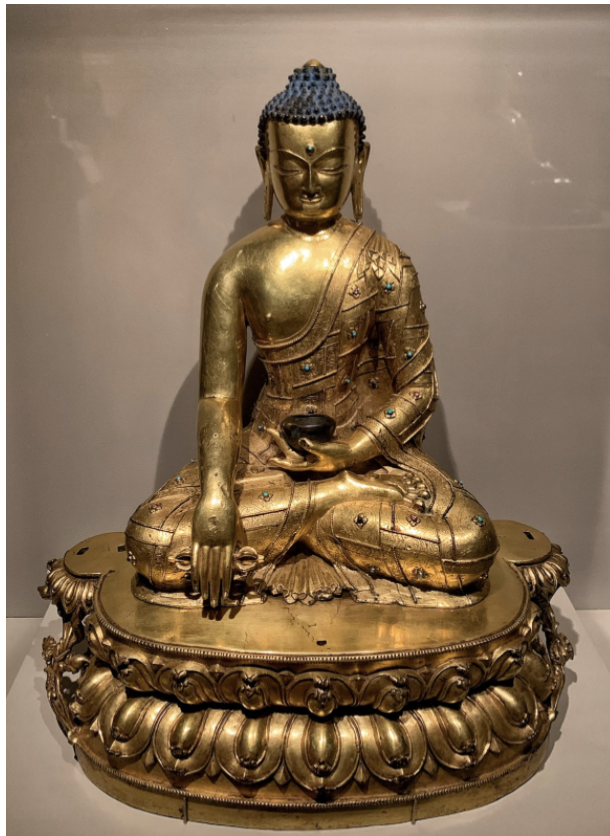
(Figure 12) Buddha Akshobhya . Central Tibet, 15th century. Gilt copper alloy with inset turquoise, garnets, and lapis, and powdered blue lapis pigment in the hair. Zhiguan Museum of Art.

This is a beautifully made, gilt, copper sculpture of Buddha Akshobhya from the 15th century in the typical Tibetan style (Figure 12). Precious stones and gems are inlaid as decorations on his garment. The turquoise gives a rich, greenish-blue accent to the sculpture, and the powdered lapis on the hair covers his head in a solemn and noble dark blue. The entire statue is decorated with natural pigments, and hence the beautiful color has survived the years. The contours of the well-formed yogic body are smooth, and as it is a