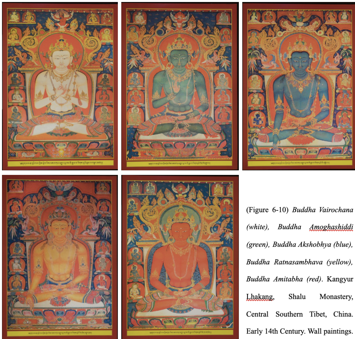
(Figure 6-10) Buddha Vairochana (white), Buddha Amoghashiddi (green), Buddha Akshobhya (blue), Buddha Ratnasambhava (yellow), Buddha Amitabha (red). Kangyur Lhakang , Shalu Monastery, Central Southern Tibet, China. Early 14th Century. Wall paintings.

displayed in red in the ‘west,’ at the top of the diagram. North is at the right of the diagram, with Vajra Family and Buddha Amoghasiddhi colored green. Finally, blue Buddha Akshobhya of karma Family is located on the east side.