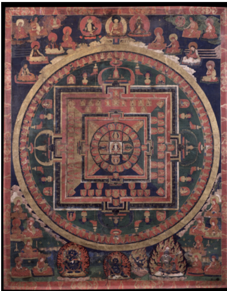
(Figure. 15) Mandala of Vairochana Buddha - Sarvavid (Sarvadurgati Tantra) ཀུན་རིག་རྒྱལ་པོར་སྣང་མཛོད།. Tibet. 1600 - 1699. Sakya. 88.90x69.85cm (35x27.50in). Ground Mineral Pigment on Cotton. Rubin Museum of Art. acc.# P1998.28.4