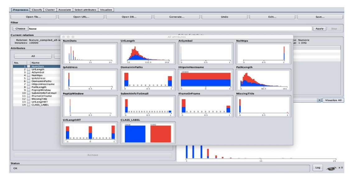
Figure 2. Feature Visualization in WEKA

ROC value of 72.9%. The NB classifier was the least with 69.9% predictive accuracy and a ROC of 77.9%.