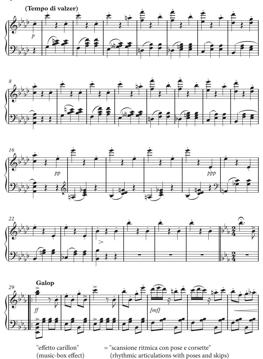
Example 11.1 Romualdo Marenco, 'Galop', preceded by a waltz, from Excelsior (1881), piano reduction

involved, giving the overall impression of a collective wave. This action is answered by a much slower, more deliberate one: over the course of an entire four-bar phrase the armoured men protractedly raise clubs from the stage floor, while the rest of the cast bend down equally slowly. A complementary four bars provide the opposite movement: the men lower