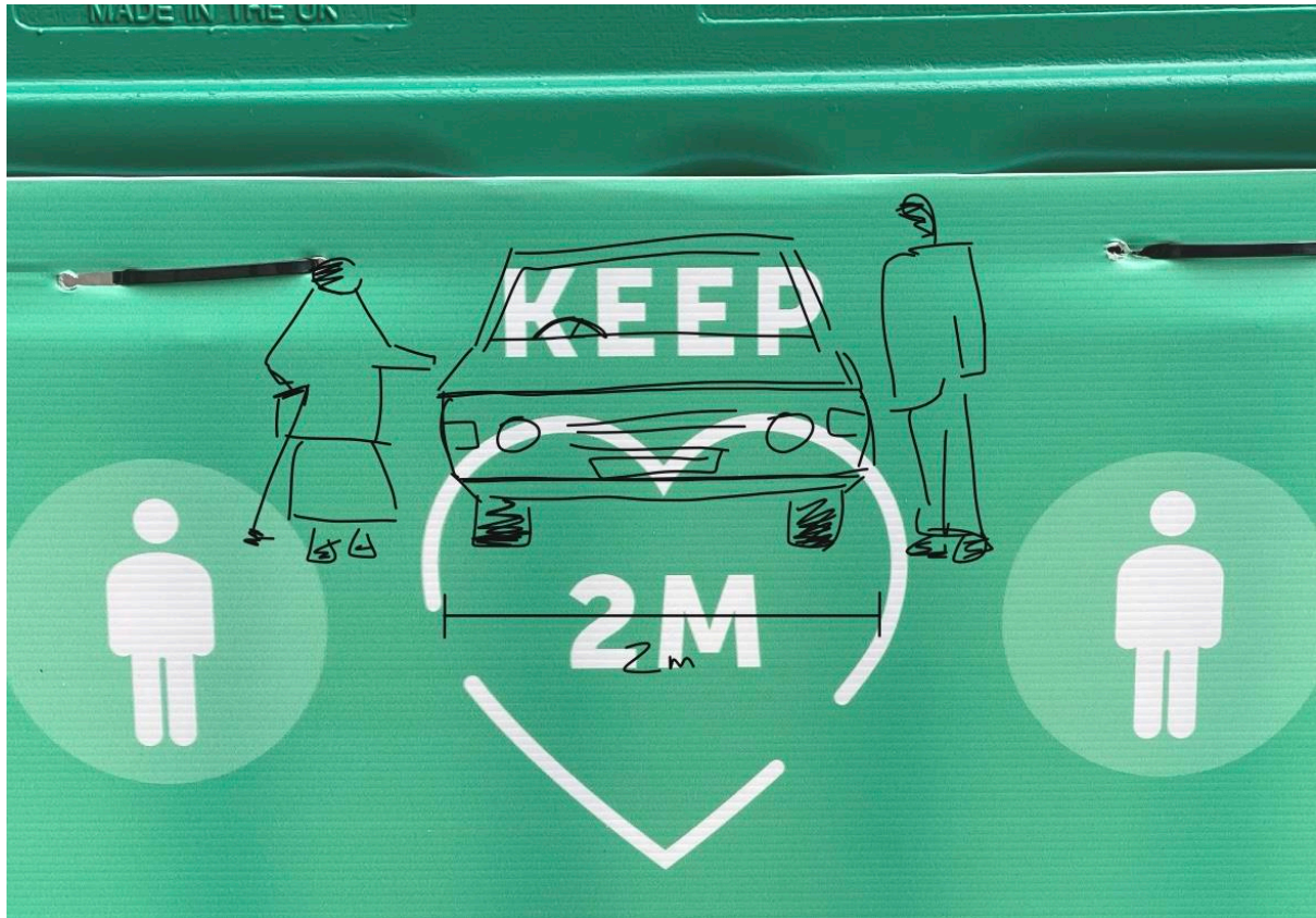
Figure 1. 1:100 scale drawing of a car and figures over two metre social distancing signage. Image and drawing: Zoe Laughlin.

If it was clear from our consideration of assembly that theatre faced a profound problem of not knowing how to go on, it was also clear that alternative or experimental forms of performance (durational, peripatetic, landscape, installation, autoteatro, intermedial) offered various ways forward. 1 The theatre auditorium – as Andrew suggested – had become a space of paranoia; the widely-circulated image of the ‘gap-toothed’ auditorium of the Theater am Schiffbauerdamm in Berlin – with swathes of its seats removed – merely reinforced the pervasive sense of the virus’ presence and revealed the extent to which the theatre auditorium is an anthropocentric apparatus, adapted to particular ecological conditions. Perhaps, in re-thinking possibilities for the spatial conditions of assembly, we need to do what Una Chaudhuri (2018) with the members of Climate Lens call ‘the scalar slide’, a movement between the tiny and the vast in which we might mark connectedness, but where the human-scale is no longer the measure of all things.