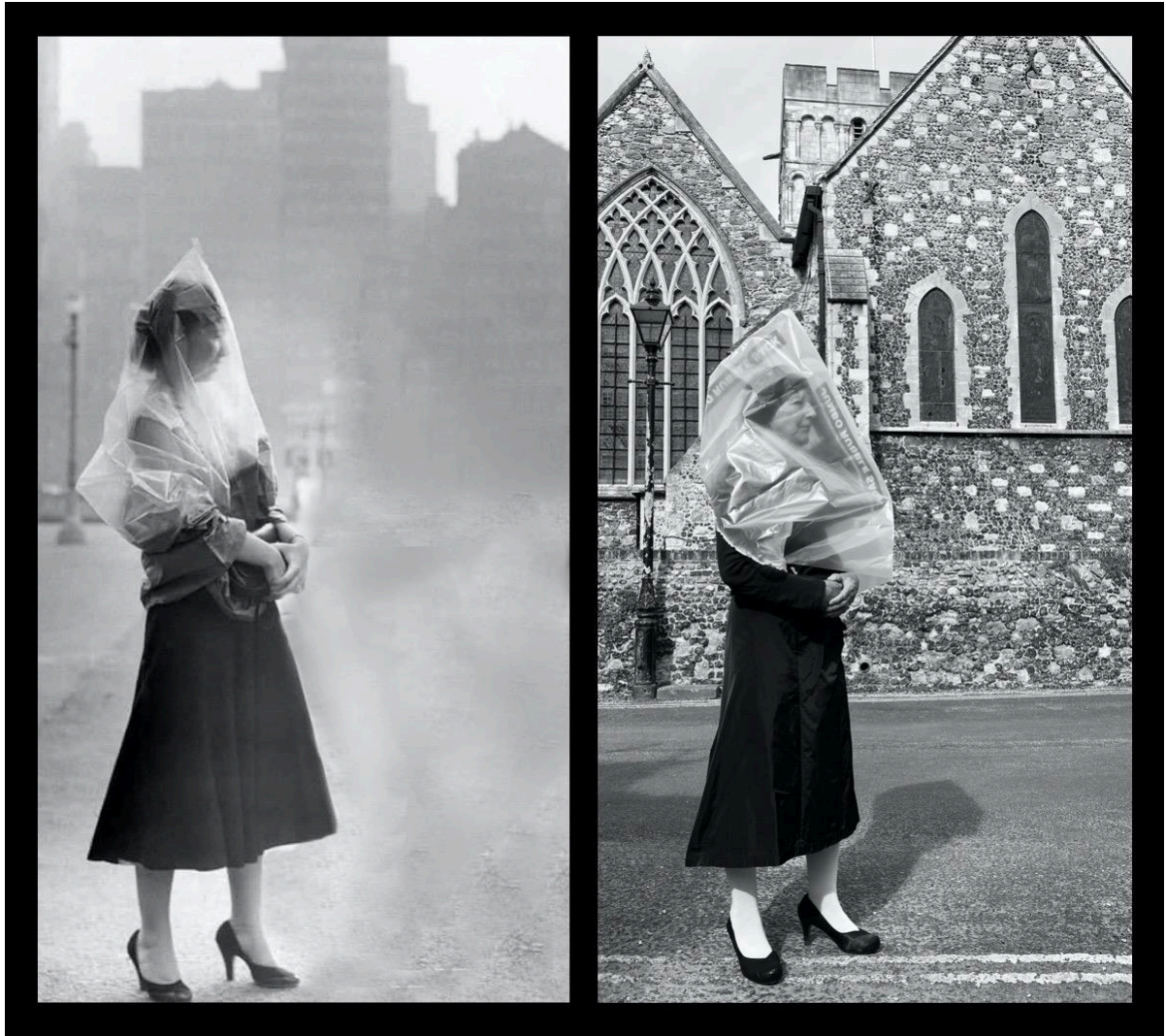
Figure 5. Homage to techniques of improvisation and the paraphernalia of previous pandemics.