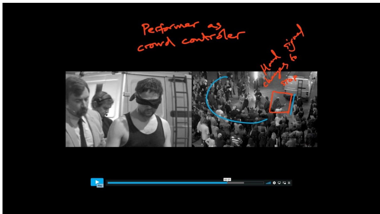
Figure 2. Screenshot of the video documentation of Coriolanus , demonstrating the multiple perspectives offered by different camera feeds. Image: Pearson/Brookes, drawing: Zoe Laughlin.

In the second thematic block we considered the relationships inherent to performance: in what ways – post pandemic – might we re-imagine spatial relations and physical communication? Here we looked for clues in a case study: NTW’s 2012 production of Coriolanus – directed by Pearson and Brookes. Staged in a vast concrete aircraft hangar, the production supplied the audience with headphones, and relayed the action via cameras and two large cinema screens installed side by side at one end of the space. This allowed the dramatic action to move quickly from one location to another, whilst enabling the audience to see and hear everything and to negotiate their own spatial positioning in relation to that action; and folding the movements and behaviours of spectators into the action itself.