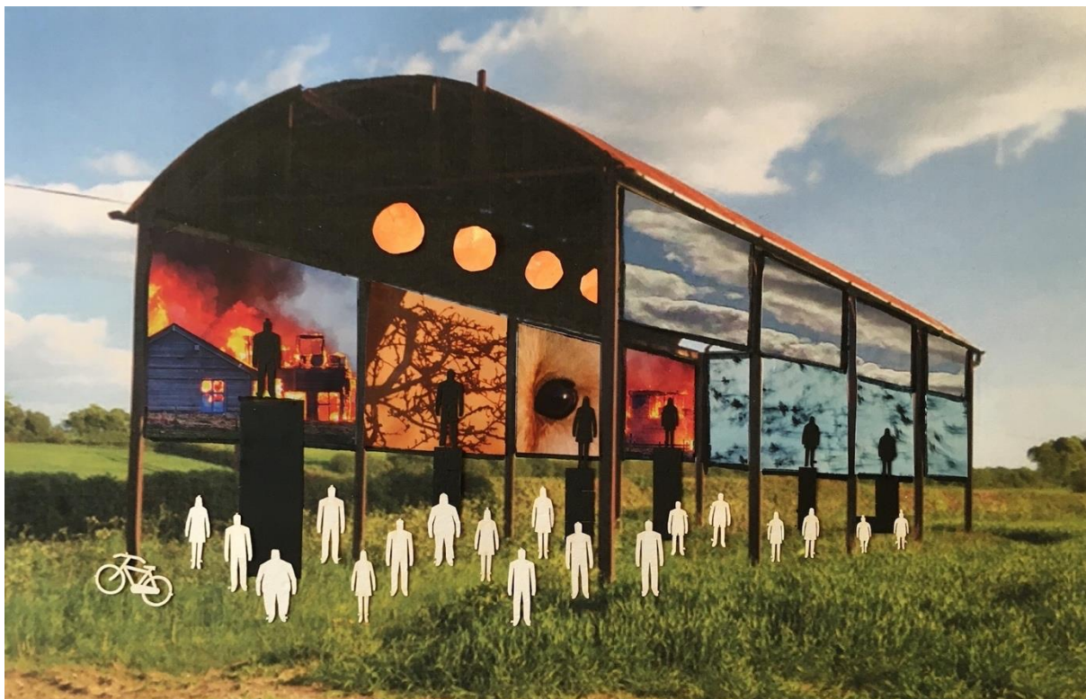
Figure 6. A proposal for a ‘Broadcastable Dutch Barn’. Image: Mike Pearson

‘residents’ and ‘visitors’, and would need to have in-built tools for amplification, telepresence and broadcast, whilst also enabling the use of tools that ‘visitors’ might already possess. In Wales – and beyond purpose-built venues – such a space might best take the form of an existing agricultural structure: a livestock shed, equestrian arena, a hay shed, or a ‘broadcastable dutch barn’ (Figure 6). Such a space might be used for experiments in preparation, staging and presentation to examine possible approaches to audience assembly, to the spatial and physical relationships between different orders of participant (performer/spectator, performer/performer, spectator/spectator), to different modes and techniques of dramatic expression, and to the integration of audio-visual technologies. Importantly, too, any brief for its use should encompass consideration of different experiences of risk, and incorporate an understanding of sustainability and production, with sustainability defined through processes rather than the potential recyclability of materials. In terms of event streaming we might consider the co-presence and position of multiple audiences, particularly the live in-person and the live digital. Such proposals are necessarily refracted through our aesthetic preferences but seek to be open to possibility in the face of an ever-evolving pandemic and the operational conditions it imposes on performance.