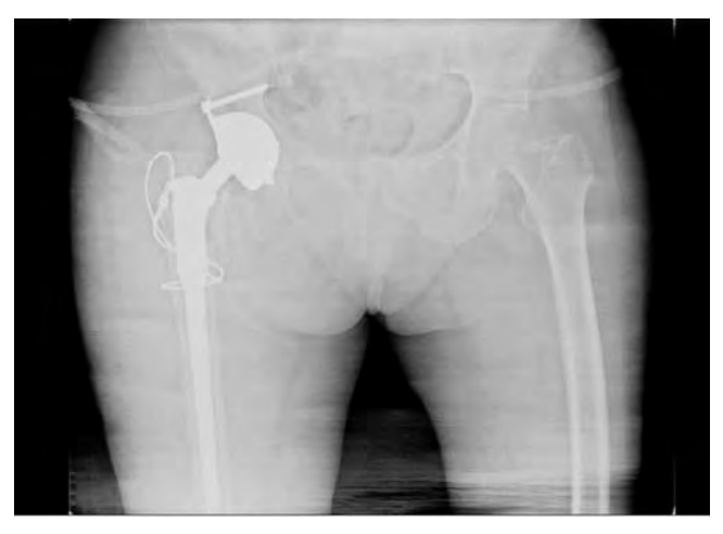
Figure-2: Post-op X-ray of right hip total hip arthroplasty with dual mobility cup.

dislocation.<sup>18</sup> In our study, 0.48% hip-operated patients had to be taken to the operating room and 1.43% were reduced manually under sedation. Many countries have increased the number of dual mobility cups like Lebanon has 88% steady and linear increase in usage of dual mobility cups from the year 2013-2017.<sup>13</sup> In 2017 more than 60% of all total hip replacement implants were dual mobility cups. The same trend has been noted in France<sup>16</sup> and the United States of America.<sup>6</sup> Chahine et.al shows the mean Hip Harris hip score to be as high as 94.8 to 98.7<sup>13</sup> and our post-operative mean Harris hip score was 75.9 which is a fair score as per criteria. The reason for this figure could be some of the complications that are reported and sometimes patients do not respond properly in clinic.