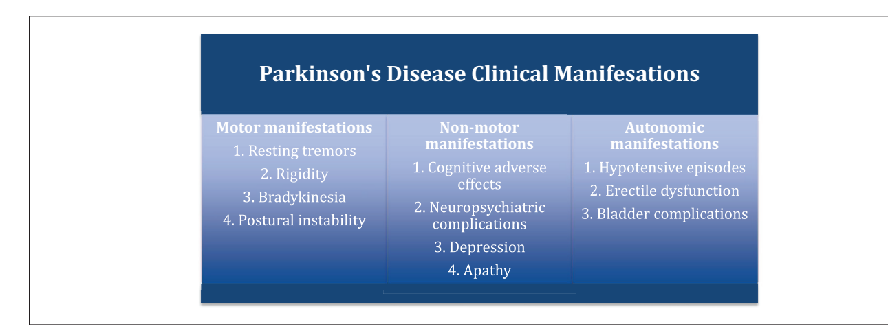
Figure 1. Clinical manifestations of Parkinson's disease.

Coronaviruses are enveloped positive single-stranded RNA viruses, and the 3' terminal contains structural proteins. The Spike (S) protein allows the virus to fuse to host cell membranes in proximity to infected and uninfected cells.<sup>4</sup> A surge in the levels of cytokines (TNF- \alpha , IL-6, IL-8, and IL-10) have been reported, leading to a suppression of T-cell response. 5 To date, a multitude of studies have assessed the role of angiotensin-converting enzyme 2 (ACE2) receptors in the increasing vulnerability of hosts, however, there is a dearth of analysis on the role of ACE inhibitors in treating Parkinson's disease (PD) patients. A meta-analytical study found that PD is a common comorbidity in older patients with COVID-19, which is also associated with poor in-hospital outcomes.<sup>6</sup> The results of the meta-regression further consolidated that mortality from COVID-19 was statistically associated with age, and not with gender or dementia, which is key in monitoring PD to minimize infection risks and prevent adverse events.<sup>6</sup> In this systematic review, we aim to provide an updated, thorough analysis of associations between COVID-19 and neurological outcomes for patients with PD.