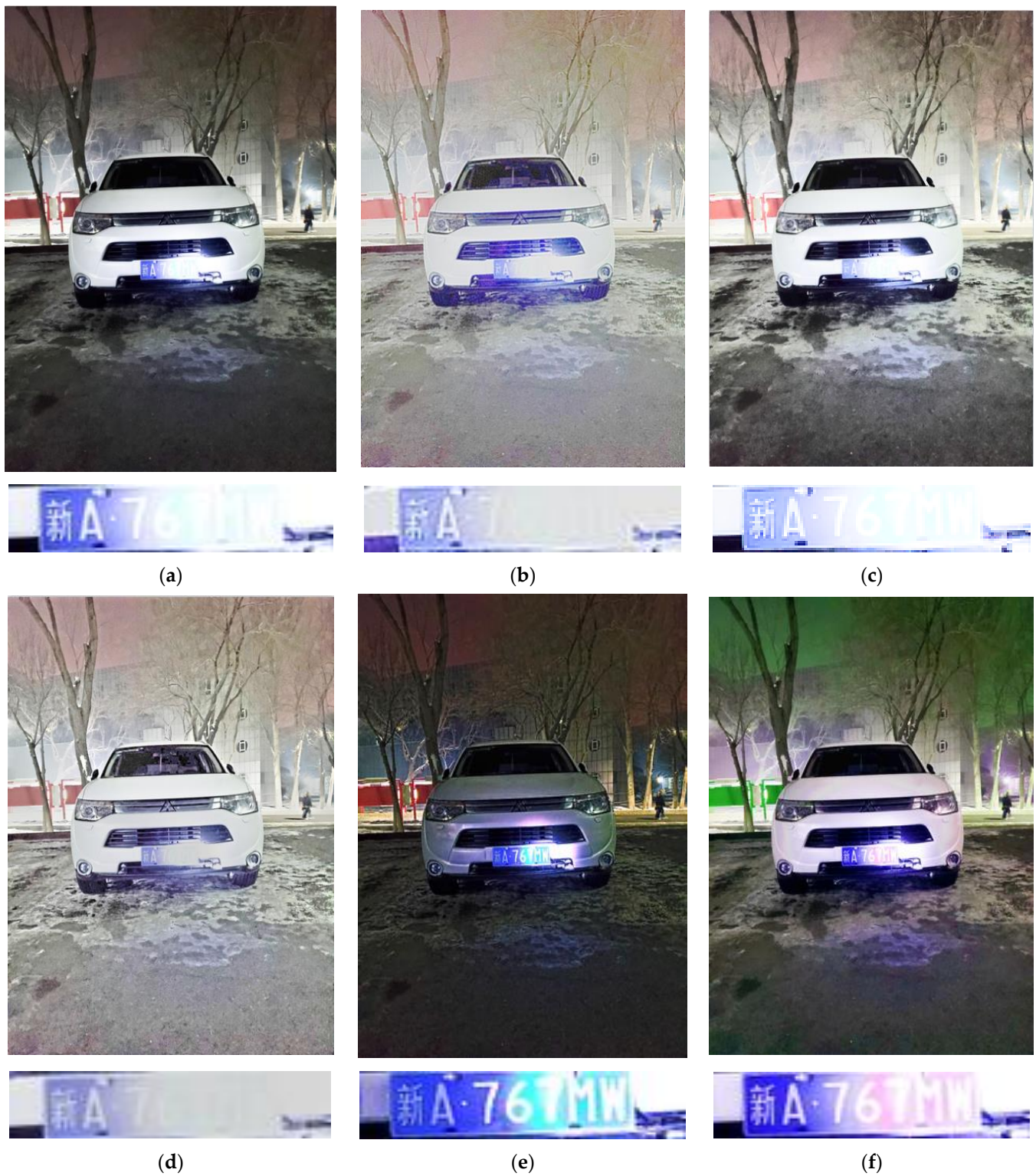
Figure 6. Experimental results: (a) original image, (b) Hui [35], (c) Khan [36], (d) Liang [21], (e) Xin [37], (f) proposed.