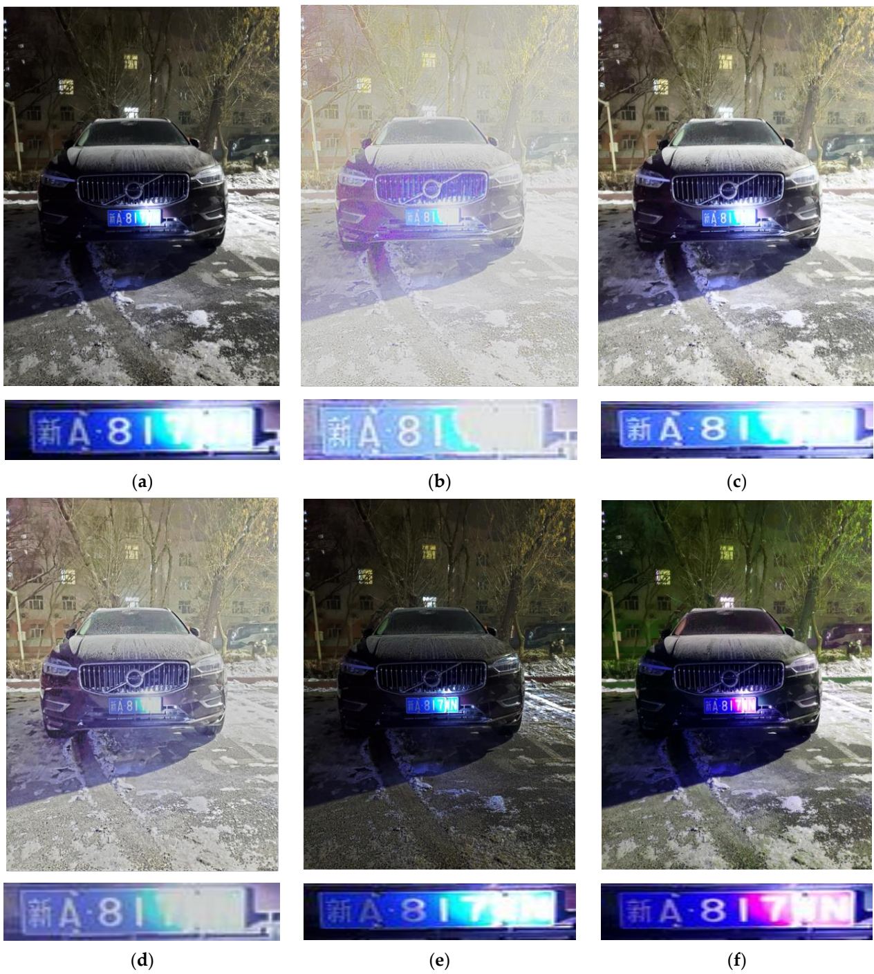
Figure 4. Experimental results: (a) original image, (b) Hui [35], (c) Khan [36], (d) Liang [21], (e) Xin [37], (f) proposed.