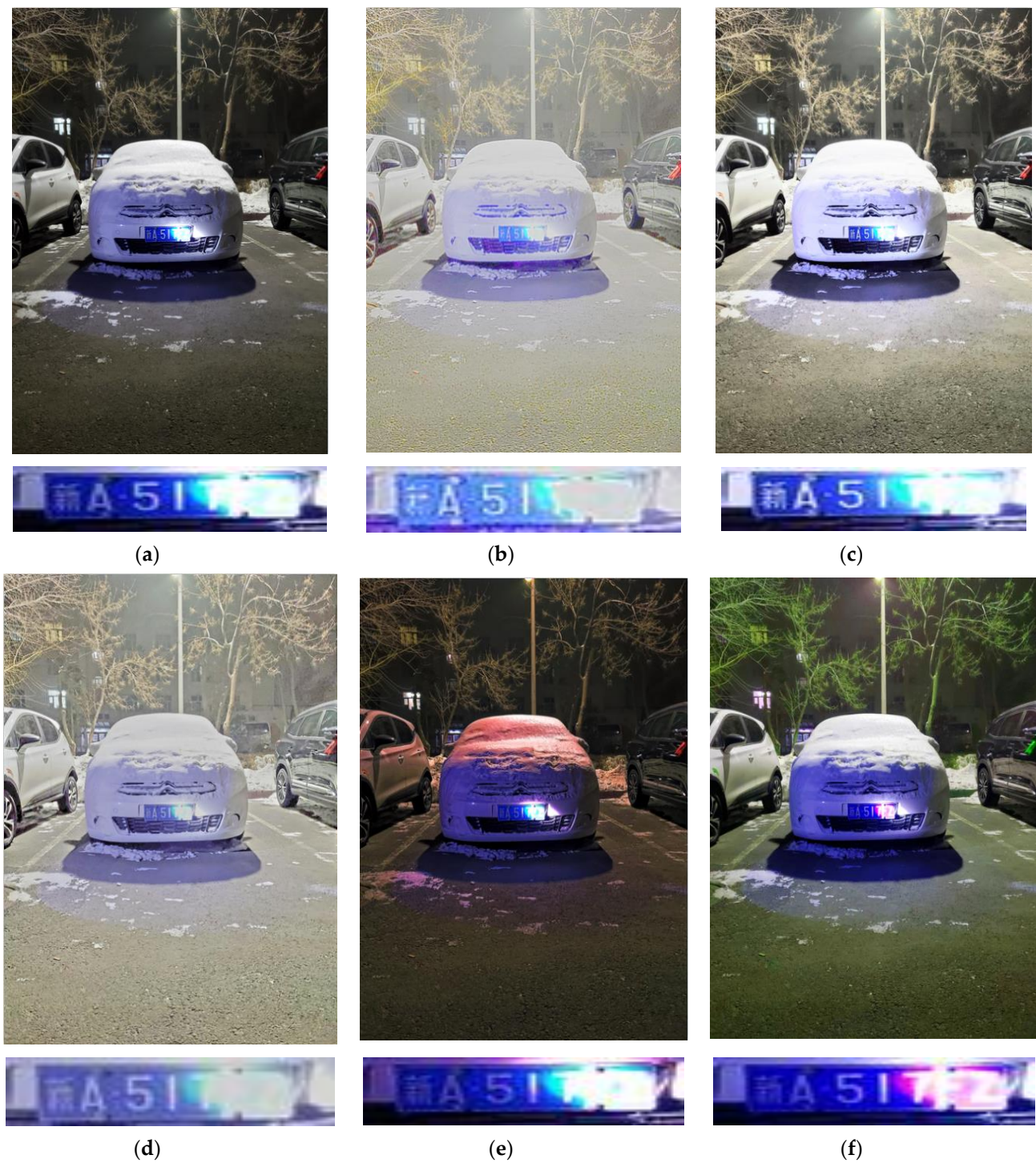
Figure 5. Experimental results: (a) original image, (b) Hui [35], (c) Khan [36], (d) Liang [21], (e) Xin [37], (f) proposed.