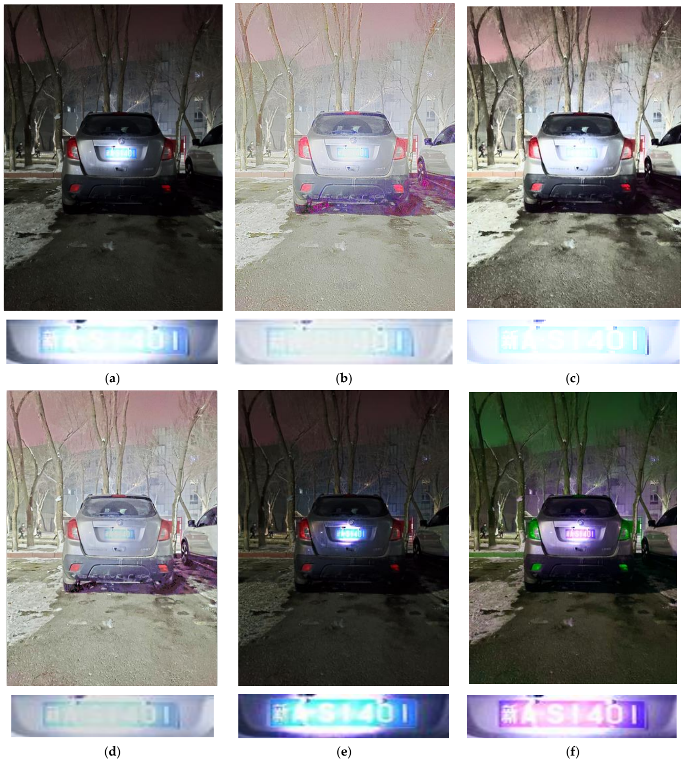
Figure 7. Experimental results: (a) original image, (b) Hui [35], (c) Khan [36], (d) Liang [21], (e) Xin [37], (f) proposed.