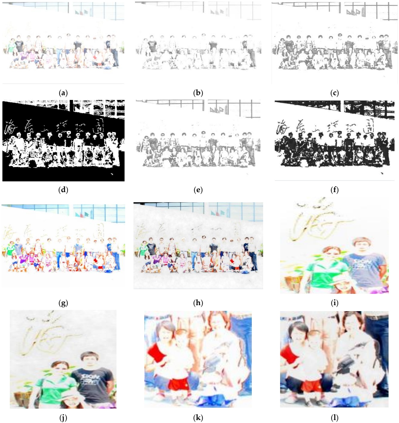
Figure 3. (a) Original image; (b) original radiance map I^h(i) ; (c) map of the mean radiance \mu_i ; (d) map of the standard deviation \sigma_i ; (e) the guidance map generated by (6); (f) the visualized guidance map c_i ; (g) the result obtained using the guidance map shown in (e); (h) the result obtained using the guidance map shown in (f); (i–l) the comparison of the details of figures (g,h), respectively.

Figure 3h generated by our algorithm is better in terms of its color, visual effect and detail processing. The detailed comparison is shown in Figure 3i–l.