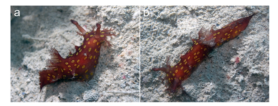
FIG. 1. A pair of the "rare" nudibranch Plocamopherus ocellatus observed in the Red Sea (Saudi Arabia), Farasan Banks, east side of Safiq Island. (a) One individual (~20 mm long) is contracted; (b) the other one (~30 mm long) is extended. Both were crawling together on sand at 27 m depth (5 May 2017) and observed by B. W. Hoeksema during scuba diving.

The nudibranch Plocamopherus ocellatus Rüppell & Leuckart, 1828 received increased scientific interest as a Lessepsian migrant when diver observations since the 1980s became the basis for publications (Appendix S1: Table S1). The recent discovery of two small specimens in the Red Sea (Fig. 1) drew attention to the question of whether it was more frequently encountered in the